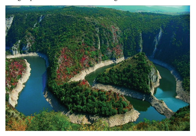
Figure 3. The river Uvac as natural phenomena and a multifunctional eco-system

Clustering municipalities around eco-services delivers positive externalities (benefits) but for some parties negative (costs) too. The pottable water is the most important service for each of the municipalities but one of them will have costs due to the large protected areas (water sources and protected nature) on its territory. The discontent of particular municipality to-day is resulting from land use limitations and building restrictions but primarily from the lack of resource rent and compensations, that is internalizing costs for the negative externalities. Practically solving this problem would be one of main duties of the integrative institution, agreed and constituted at the level of a functional region. Other important duties would be: (1) educating population on the role and meaning of eco-services for their future economic development, (2) providing market for organic food and guaranteed income for producers, (3) defining rules for constructing and integrated constructions in the landscape, and (4) incorporating the idea of eco-services into tourist strategies with necessary standards in accomodation, food, facilities etc. This might contribute to employment, improving age structure and activating depleted and underused housing stock in rural areas.