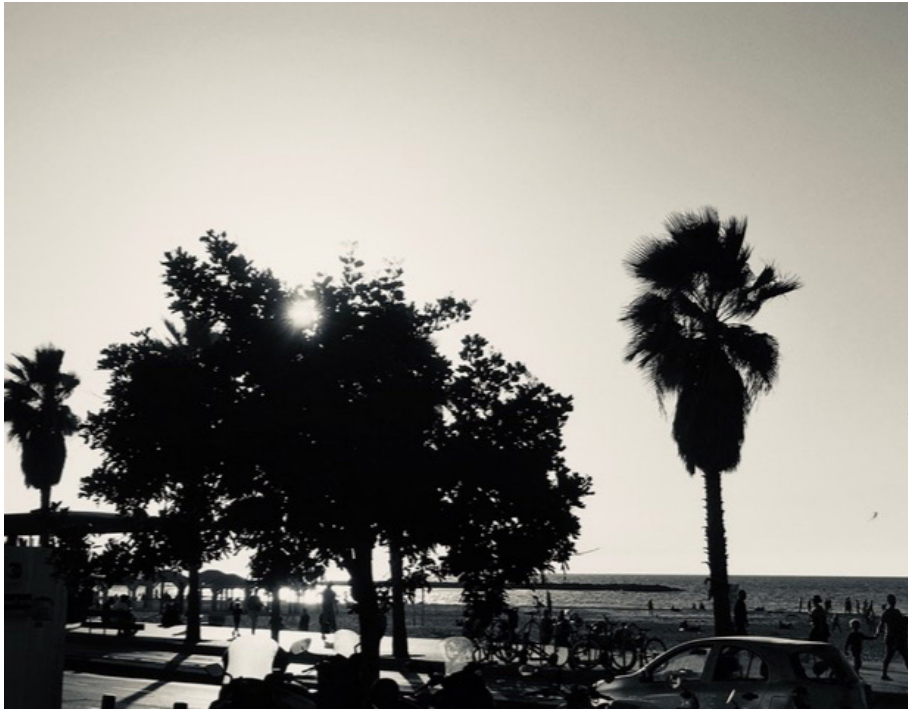
Figure 3. Tel Aviv waterfront