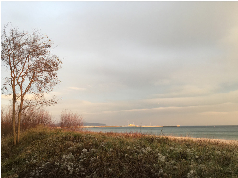
Figure 1. The Bay of Gdańsk at Sopot, Poland with a view of the Sopot Pier and the Orłowo Cliff

Assuming that maritime space is part of the wider geographical space in its real terms but also in its formal and perceptive dimension, it is important to identify the relationship that constitutes maritime space as a subspace of geographical space. The main problem is the different geographical extent of those relations. They are of socio-economic (economic), natural (including