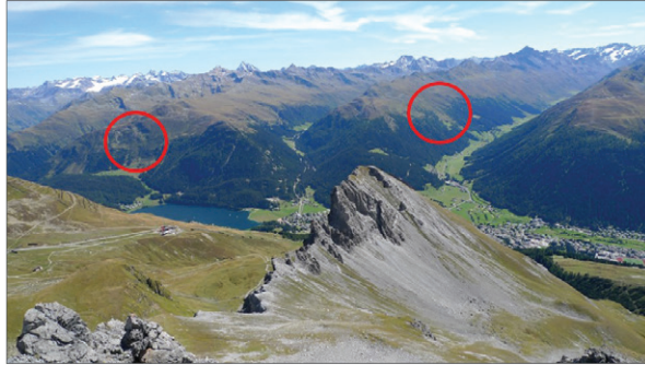
Figure 3. The position of treeline can vary due to the effects of disturbances such as snow avalanches (left), fires (right), or pathogens, which can suppress treelines below their climatic limit