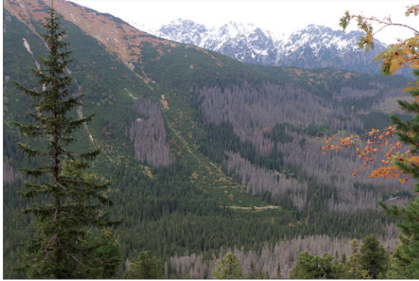
Figure 2. The complexity and interactions of treeline drivers include interactions between climate, snow avalanches and pathogens. Here, the 2000s bark beetle outbreak in the Western Carpathians, which initially only affected low elevation planted spruce forest, but eventually spread to subalpine forests, including the treeline ecotone, which is also influenced by climate

future climate change could result in changes in snowfall and temperature, which may affect local avalanche regimes, especially in lower elevation subalpine forest. Future climate scenarios may also be characterized by lower overall precipitation and higher temperatures, which may fundamentally alter fire regimes and outbreaks of tree-killing insects and pathogenic fungi, even in regions that have not been affected by these disturbances over the past decades to centuries. Consequently, such changes in these disturbance regimes may set the stage for novel interactions among disturbances that could affect treeline position and ecosystem trajectories. Additionally, regeneration following these altered disturbance regimes may also be affected by the direct effects of climate on tree demography. Thus, changes in climatically-driven disturbances, including fires and insect outbreaks are critical to treeline dynamics but are likely to differ between broadleaf and coniferous species (Piermattei et al. 2012).