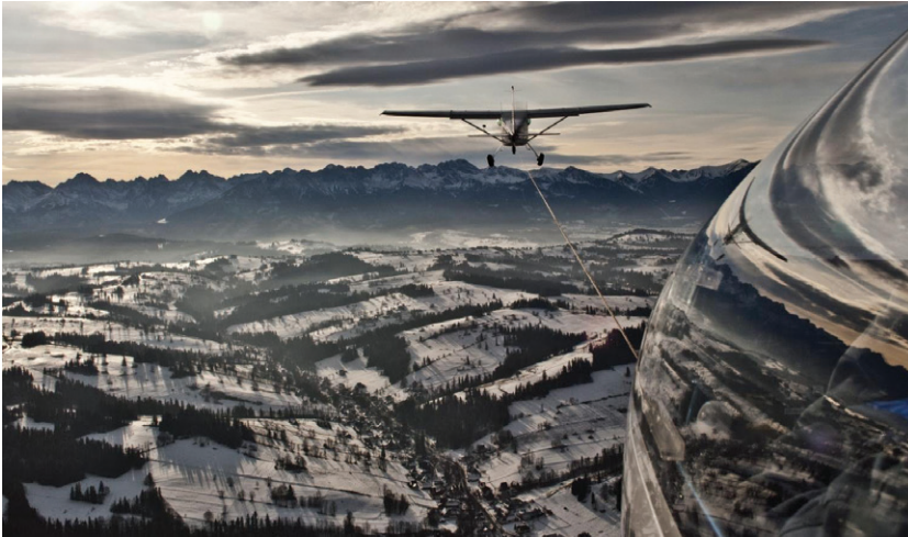
Figure 3. Towing of a glider during studies of lee waves in the northern foreland of the Tatra Mountains. Photograph was taken on 13 December 2014 at 11:16 UTC in the area of Ratułów village in the southerly direction. Above the Tatra Mountains wave clouds Alto cumulus lenticularis are visible

the wind speed, the more frequent the occurrence of negative anomalies and the greater the magnitude of the anomalies. Therefore, in final conclusions it was assumed that the deformations of the pressure field may have been the result of interactions among many factors, including lee waves, whose impacts can often overlap.