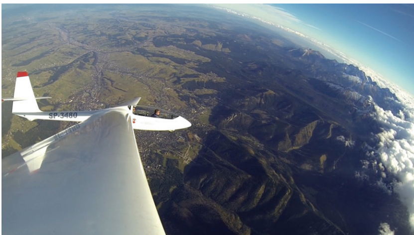
Figure 2. Glider during flight aimed at studies of lee waves in the northern foreland of the Tatra Mountains. Photograph was taken on 4 November 2014 at 10:21 UTC in the area of Kościelisko village in the easterly direction

Conclusions on pressure field deformations caused by lee waves were limited by the accuracy of atmospheric pressure measurements. Many pressure anomalies, especially in the northern part of the study area, were of small magnitude, thus the differences in distribution of atmospheric pressure can be explained by errors related to the accuracy of measurements. Additionally, wind gusts were identified as another factor affecting formation of the pressure anomalies. The following relationship was recognized: the higher