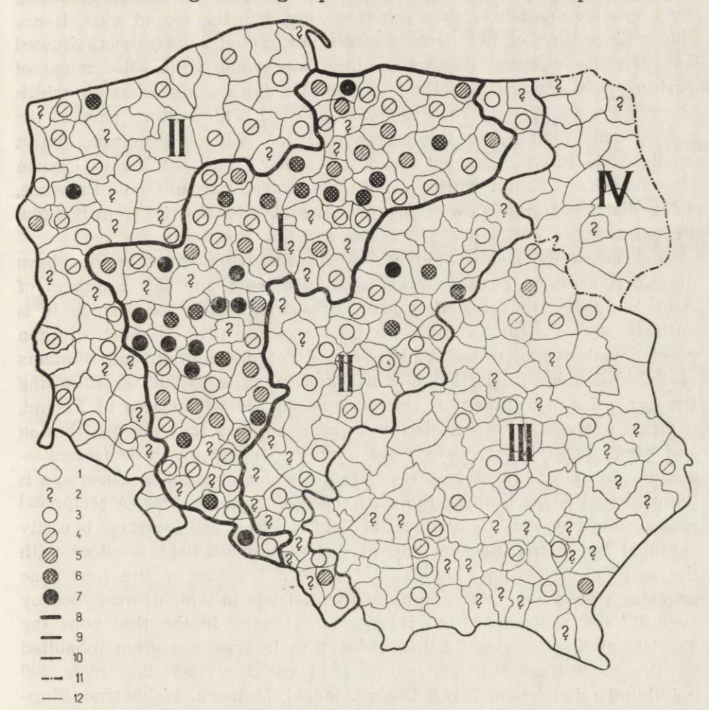
Fig. 2. Distribution of field roe-deer on the area of Poland in 1969. 1 — districts without field roe-deer; 2 — lack of data; 3 — numbers below 50 individuals per district; 4 — from 51 to 200 individuals; 5 — from 201 to 350 individuals; 6 — 351—500 individuals; 7 — above 500 individuals; 8 — first zone, 9 — second zone, 10 — third zone, 11 — fourth zone, 12 — boundaries of districts.

On the basis of analysis of distribution and numbers of field roe-deer in Poland four zones of its occurrence can be distinguished. The criterion for the separation of the first zone is uninterrupted continuation of districts, each of them being inhabited by at least 50 individuals of field roe-deer (Fig. 2). This number has been selected since according to the data of the Research Station of the Polish Hunting Association at Czempiń it corresponds to 7—10 herds of roe-deer observed during autumn and winter stock-taking. Such group of roe-deer cannot escape attention