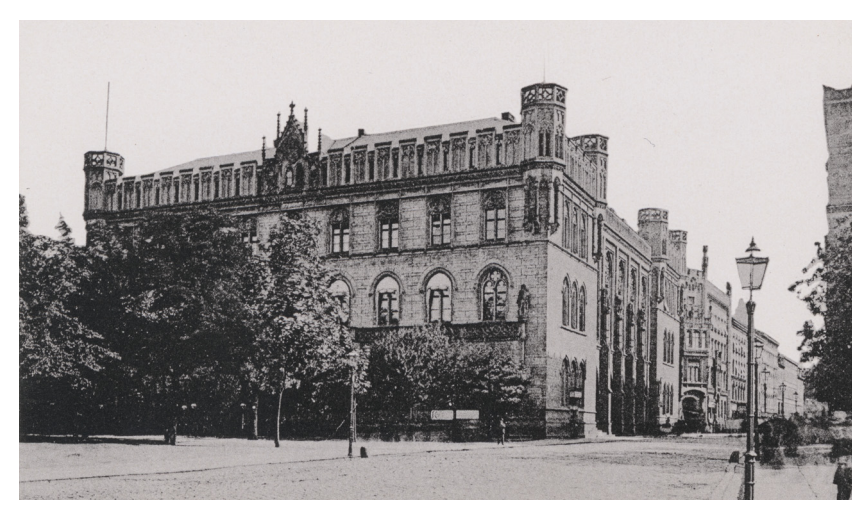
Fig. 3. View of the New Exchange, 1892

would never acknowledge the change that overwhelmed the capitalist realities – coincided with Silesian traders' endeavours to regain Eastern markets. The Jewish economic elites were perceived as competitors or rivals; in parallel, they were indispensable for the reestablishment of commercial and business contacts with the East of Europe. Let us stress, though, that as years passed, the Christian-Jewish conflict gradually calmed down. In some economic initiatives – particularly those that called for a significant capital to be involved, as in railway and specific other industries – both parties collaborated peacefully and in mutual agreement. Family connections and marriages of grand families, founded upon religious conversions, favoured the trend. In the early 1860s, when the decision to build an exchange edifice was finally made, compromise and reconciliation were sought, rather than continued or exacerbating dispute. The new Exchange in Breslau brought an almost symbolic end to the conflicting interests, clashes, contestations, and exclusions that had been lasting there for two centuries. The Exchange was a collective project involving both Christian and Jewish trade and commerce circles united for the common goal - to rebuild the commercial power of Silesia's capital city and reinstate its leading role in trading between the West and the East.