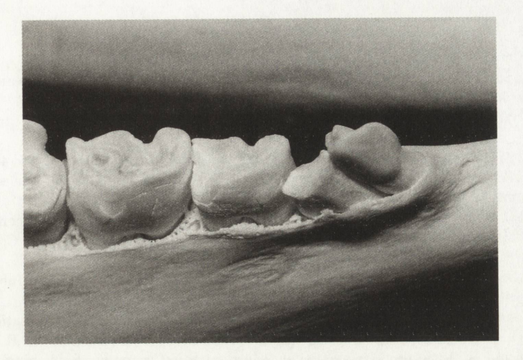
Fig. 3. Lower right dentary (P_4, P_3, supernumerary premolar, P_2) of Female 2, a mature female American bison. Supernumerary premolar is in the tooth row between the P_2 and P_3 .

Although ancestral forms of bison contained four premolars, the cases reported here likely do not represent recovery to this ancestral state. Vestigial first premolars do occasionally appear in bison, but they occur in the middle of the diastema, not adjacent to the other cheek teeth (Fuller 1954). Further, the supernumerary premolars were very similar in size and appearance to the normal P_2 but very dissimilar to the normal P_3 . As is characteristic of normal P_2 teeth in bison (Węgrzyn et al. 1990), each supernumerary tooth had a short and wide crown, a sharp peak of enamel in the cranial (anterior) lobe, and small depressions in the caudal (posterior) lobe. Thus, we conclude that the supernumerary premolars are P_2 teeth, resulting from a splitting of the P_2 tooth germ (Wolsan 1984).