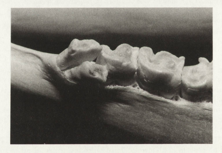
Fig. 2. Lower left dentary ( P_2 , supernumerary premolar, P_3 , P_4 ) of Female 2, a mature female American bison. Supernumerary premolar is outside the tooth tow on the labial side, between the P_2 and P_3 .

premolars, one on each dentary. The supernumerary premolar on the left dentary was outside the tooth row on the labial side, between the P<sub>2</sub> and P<sub>3</sub> (Fig. 2). The supernumerary premolar on the right dentary was located in the tooth row between the P<sub>2</sub> and P<sub>3</sub> (Fig. 3). The skull of Female 2 was deposited in the Miseum of Wildlife and Fisheries Biology at the University of California, Davis (specimen # WFB 2637). All permanent teeth in the two females were fully erupted and in regular wear, including the third cusp of the M^3 , so these bison were nature individuals at least five years of age (Frison and Reher 1970).