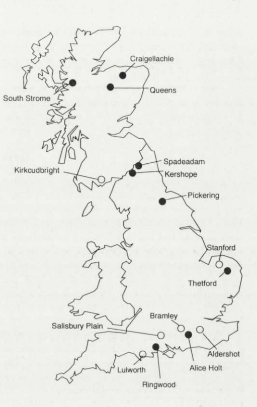
Fig. 1. The location of the study sites (filled circles are Forestry Commission plantations, open circles are Ministry of Defence training areas).