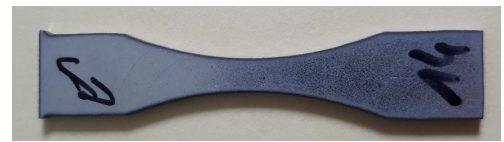
Figure 2: Image of the specimen geometry. The specimens from 1.5 mm DP800 sheets are 50 mm long.

Acknowledgments The financial support of the German Research Foundation (DFG), Transregio 188 "Damage Controlled Forming Processes" (TRR 188) within project C2, is gratefully acknowledged.