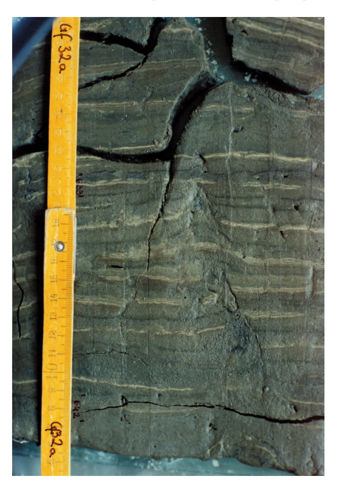
Fig. 1.6 . Example of top sediment (around AD 1920–1930) collected by freezing technique.

The strategy of palaeoecological studies was as follows: the analyses of cores from the central lake deep and also from the western deep in their Late-Glacial part, per-