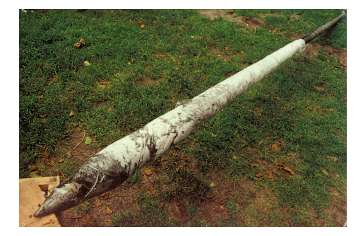
Fig. 1.5. Freezing sampler ("cold-finger" tube type), covered with frozen sediment. (Phot. A. Walanus).

and Holocene representative for eastern-central Europe, grounded on a precisely built-up calendar timescale. In addition, the construction of full calendar chronology over the last 13,000 years could offer the possibilities to verify the chronological scales used hitherto, the radiocarbon timescale included. To understand well the past changes, the genuine and detailed knowledge of the recent environment of the area and of the lake hydrologic and eco-systems was also required, as well as the information on the history of past human settlements in the region. As the existing source data appeared deficient or absent, special investigations on these subjects were also planned.