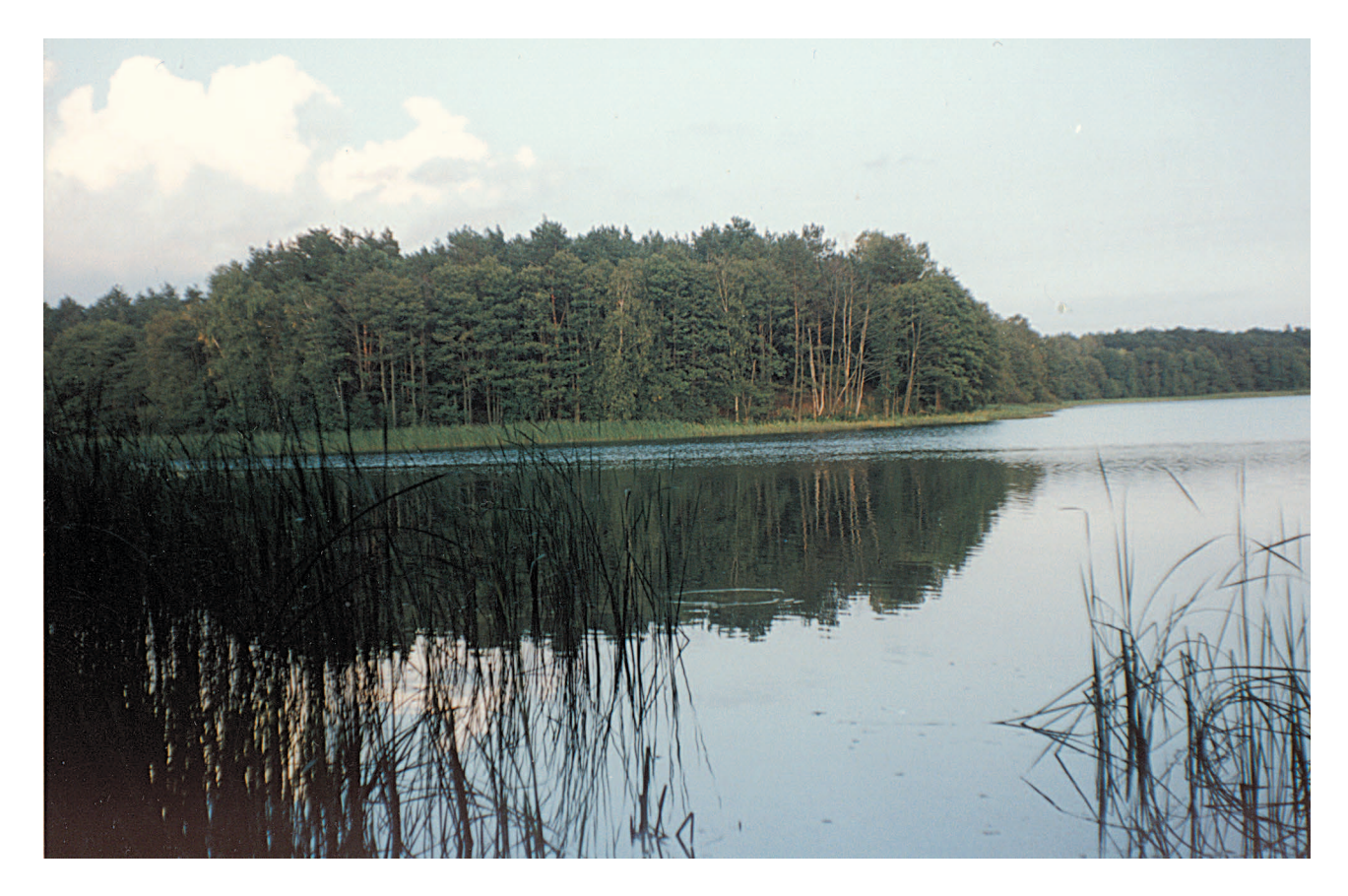
Fig. 1.7. Lake Gościąż in summer time.

formed on continuous varved sediment sequences, were focused first of all on regional changes. Highest importance was attached here to the precise dating of recorded events. The studies on cores from the lake margins and from neighbouring depressions were focused mostly on local changes of ecosystems and on hydrologic changes. They formed an individual study (D. Demske 1995), meant to be published in the second part of the Lake Gościąż monograph. As it appeared, however, the marginal cores contained non-laminated sediments deposited during the older part of the Late-Glacial which were absent from the lake centre, where the sedimentation processes started during the late Allerød only. Therefore, the results of analyses from some of marginal cores (pollen, plant macrofossils, Cladocera) have been used to complete the sequence of events recorded in Lake Gościąż before the sediments in its central parts started to accumulate.