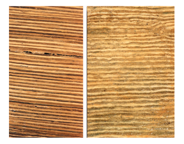
Fig. 1.3. Examples of annually laminated sediment from the lakecentre cores. Left – Preboreal varves, right – Subboreal varves. Mean thickness of laminae ca. 1 mm.