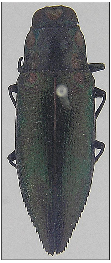
Fig. 1 Metataenia dislocata sp.n. HT ♀ [BPeov], "Aru" [?Art I.]

foveae and sutural interstria purplish-cupreous; ventral side dark blue with purplish dfp areas; antennae and tibiae blackish-ferrugineous; tarsi missing. Dfp areas covered with dense, very short, recumbent yellowish pubescence; otherwise body (including prosternal process) glabrous.