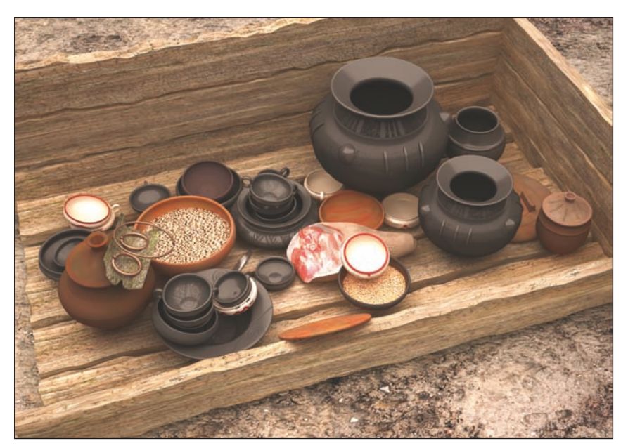
Fig. 6. 3D visualisation of the chamber tomb No. 521 (made by M. Markiewicz; archives of IAE PAS in Wrocław)