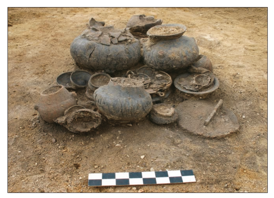
Fig. 3. Chamber tomb No. 4270 discovered during excavations carried out in the Early Iron Age cemetery in Domasław (photo by A. Zwierzchowska; archives of IAE PAS in Wrocław)

Fig. 2. Chamber tomb No. 521 discovered during excavations carried out in the Early Iron Age cemetery in Domasław (photo by A. Zwierzchowska; archives of IAE PAS in Wrocław)