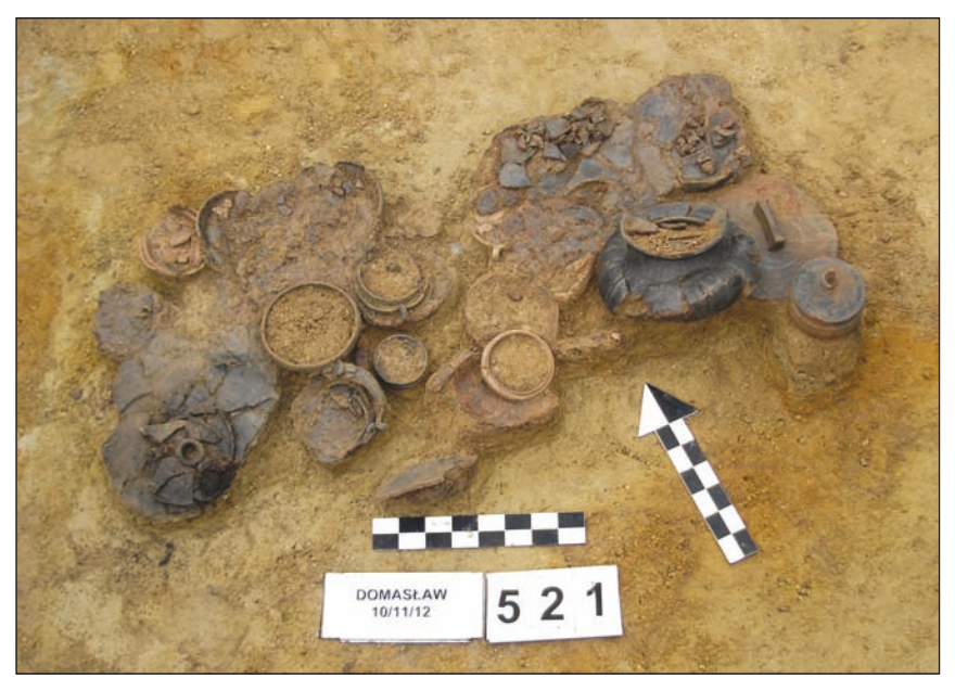
Fig. 2. Chamber tomb No. 521 discovered during excavations carried out in the Early Iron Age cemetery in Domasław