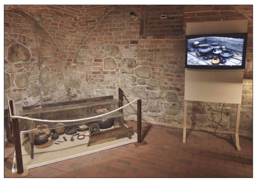
Fig. 4. The exhibition "Domasław – the Necropolis of the Aristocracy from the Early Iron Age (8th-6th Century BC)" at the Leon Wyczółkowski District Museum in Bydgoszcz

Opolian Silesia in Opole and also in museum exhibition halls in Gliwice, Racibórz, Prudnik and Będzin.