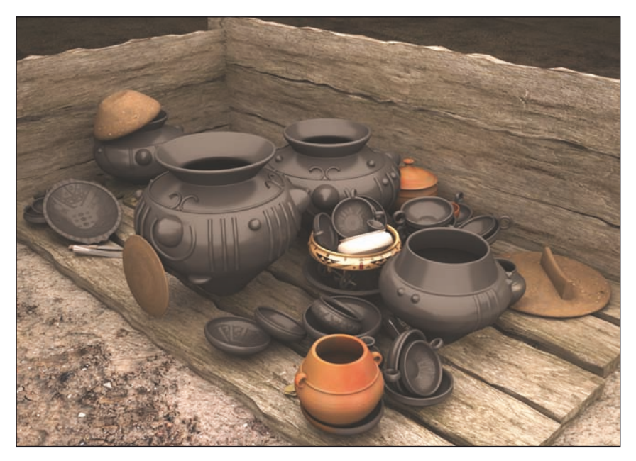
Fig. 7. 3D visualisation of the chamber tomb No. 4270 (made by M. Markiewicz; archives of IAE PAS in Wrocław)