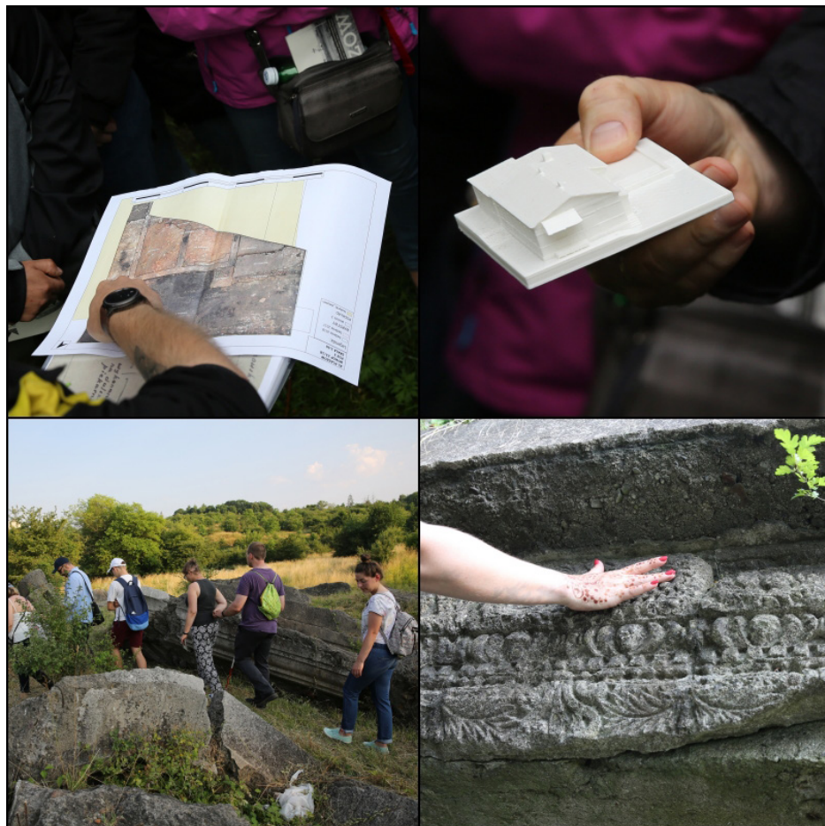
Fig. 5. Archaeology of KL Plaszow – guided walks in 2021.

information but are also encouraged to interpret and make conclusions of their own (Figs 5, 6).