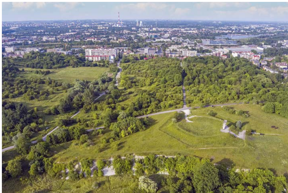
Fig. 1. The present-day area of KL Plaszow's campsite. 2016.

woods stretching from the historic buildings of the Podgórze district through areas with traces left by mining and quarries. There are numerous buildings and structures that make up the specific landmarks of this part of the city. From the Krakus' Mound, which is one of the best-known archaeological sites in the city, through more notable destinations such as the St. Benedict's church, remnants of the Cracow Fortress, with Fort Benedict included and picturesque post-mining areas. Nevertheless, along with its cultural value, this area is also a noteworthy natural complex, treated partly as an ecological reserve. This place is attractive both for tourists and residents of the overcrowded city.