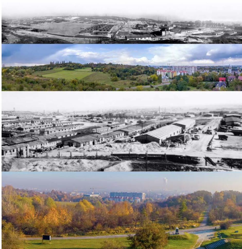
Fig. 7. Comparison of memorial site's landscapes from 1944 and 2021.

The media library will consist of a database, archival materials and information about archaeological discoveries made between 2016 and 2019. Thanks to this, knowledge about the works being carried out will be generally available. In a way, each tourist will become a historian or archaeologist for a moment.