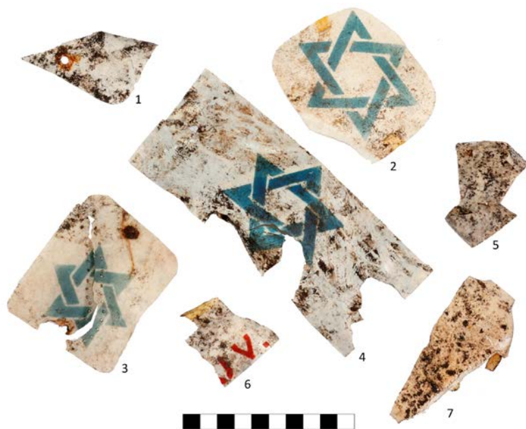
Fig. 4. Fragments of armbands directly after excavation. 2017.

traditionally associated with the game cultivated during Hanukkah. Usually, these spinning tops have a tetrahedral shape and are described with Hebrew letters. The specimen discovered in KL Plaszow is cubic and contains inscriptions in German. A fragment of an atara (an embroidered strip of fabric or a metal ornament sewn on the upper edge of a tallit) is equally unique. Small, silver, shell-shaped pieces are decorated with pseudo-filigree. There is only one item related to the Christian religion. It is a small pendant with a figure of Saint Bernadine.