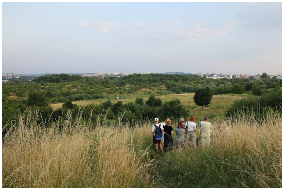
Fig. 6. Archaeology of KL Plaszow – guided walk in 2021.

archaeological terms and descriptions to learn about the past and the functioning of the memorial site today.