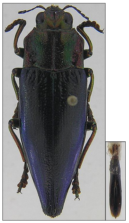
Fig. 6 Cyphogastra sp.n. FRANK ∂ [VD], Teon I.

Elytral sides obliquely truncated at humeri, without subhumeral protrusion, subparallel to midlength, and cuneately convergent to barely caudate apices; lateroapical margin sharply denticulate. Puncturation progressively finer apicalwards, but rather coarse throughout; perisutural sulcus discernible all along but conspicuus and distinctly dfp only on apical half; middiscal poorly indicated; no true perilateral but instead outermost stria deep and contrastingly cupreous.