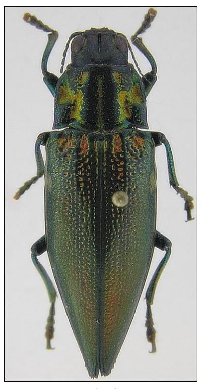
Fig. 8 Cyphogastra domeykoi sp.n. ♀ HT [VD], Moluccas: Gébé I.

Elytra without subhumeral protrusion, moderately caudate; lateroapical margin sharply denticulate. Puncturation progressively finer apicalwards, but rather coarse throughout; each elytron with two small irregular basal dfp foveolae and larger posthumeral spot – no perisutural or perimarginal sulci in apical half.