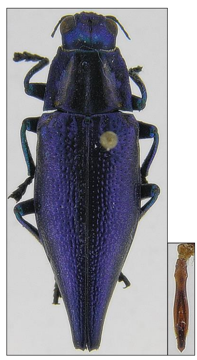
Fig. 3 Cyphogastra intae sp.n. ♂ HT [VD], NG: Jayapura