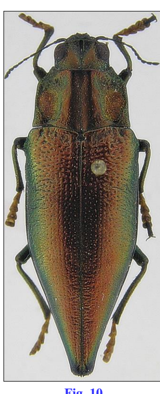
Fig. 10 Cyphogastra invictis sp.n. ♀ HT [VD], NG: Yapen I.

Proepisterna uneven, partly dfp; prosternal process and metasternum narrowly deeply sulcate; median parts of sternum finely and very sparsely, those of abdomen somewhat denser and coarser punctured; low abdominal plaque in profile roundedly obtuse-angled; perimarginal and midlateral dfp stripes poorly developed, discontinuous, broadly separated; apex of anal sternite rounded with small broadly obtuse-angled incision at middle.