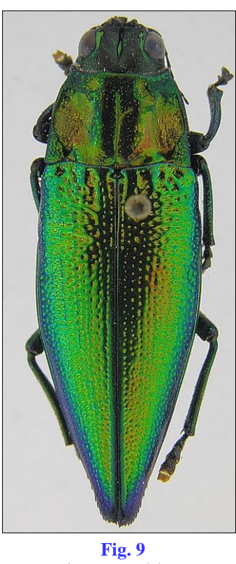
Fig. 9 Cyphogastra ralskii sp.n. ♀ HT [VD], NG: Jayapura