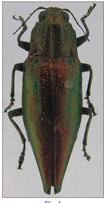
Fig. 1 Cyphogastra ludmilae sp.n. ♀ HT [VD], NG: Arfak: Indabri