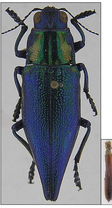
Fig. 4 Cyphogastra bruyni LSB. ∂ [EONMP], NG: Maprik