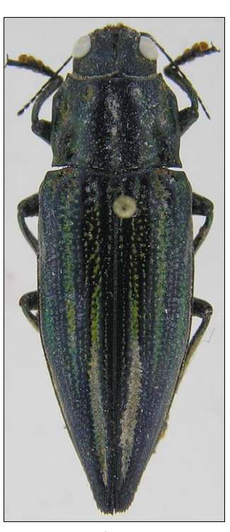
Fig. 7 Cyphogastra exul sp.n. ♀ HT [VD], Waigeo I.

Proepisterna uneven with dfp bottoms of meshes in network of smooth elevations; sulcus of prosternal process narrow, rather coarsely punctured; median parts of metasternum finely and very sparsely punctured, apical half of low but in profie right-angled abdominal plaque sparsely covered with fine, somewhat elongate punctures; perimarginal and midlateral dfp stripes broadly separated; apex of anal sternite narrowly rounded.