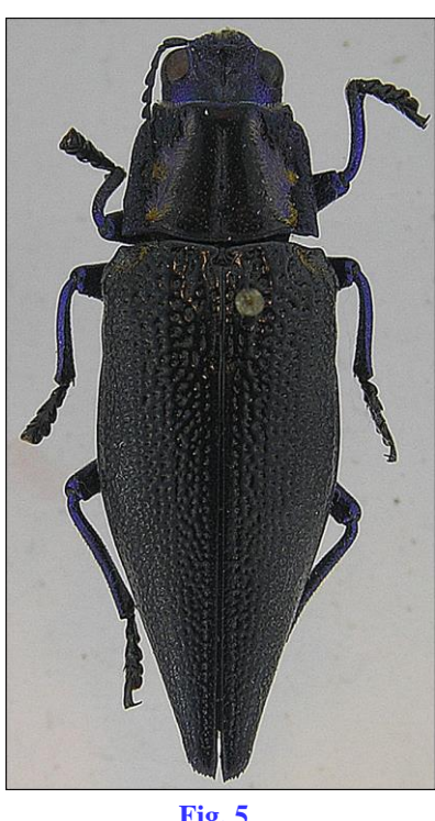
Fig. 5 Cyphogastra nigra KERR. ♀ HT [VD], NG: Klaisu