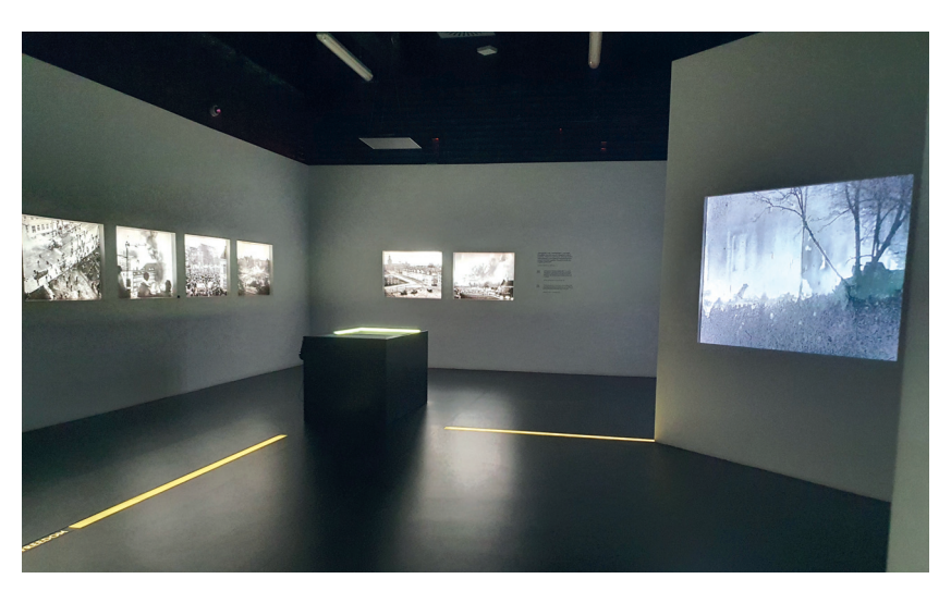
Fig. 1. Section presenting the December 1970 protests in Szczecin; the permanent exhibition, Dialogue Centre Upheavals.