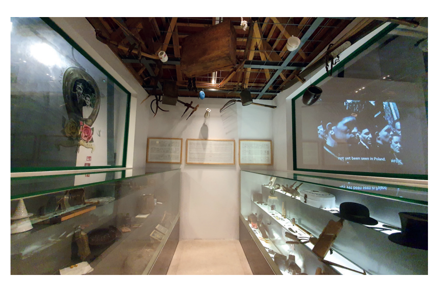
Fig. 2. Room of 'Polish' and 'German' items in 'A Foreign City' section; the permanent exhibition, Depot History Centre in Wrocław.