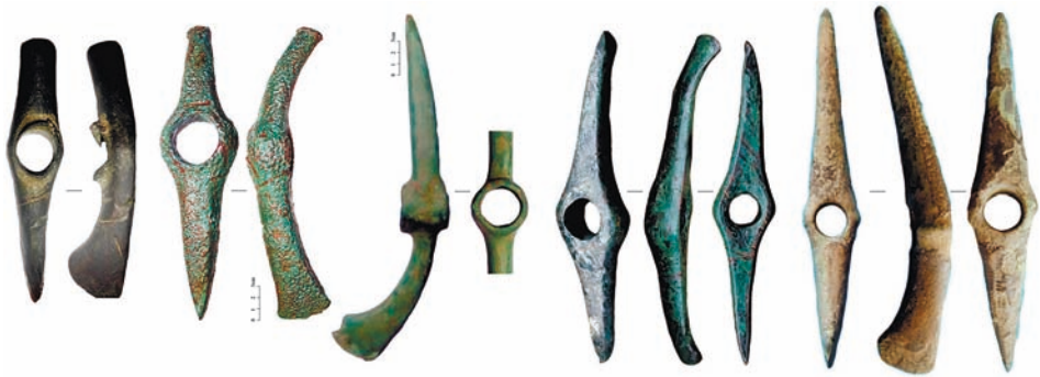
Fig. 2. Examples of the unique copper hammer-axes and pickaxes found in Ukraine. 1 – Vinnytsia region, 2 – Verben, Rivne region, 3 – Vinnytsia region, 4 – Cherkasy region, 5 – Chernivtsi region.

cluded 544 copper objects with a total weight of 1653 g (Dergachev and Parnov 2022, 7), and the Carbuna hoard which included 444 copper objects (Dergachev 1998, 29). In terms of total metal weight, the volume of known working tools is even greater. The most complete catalogue of Trypillia metal instruments published by V. Klochko (Klochko et al. 2020) lists more than 85 copper hammer-axes, flat axes and axe-adzes.