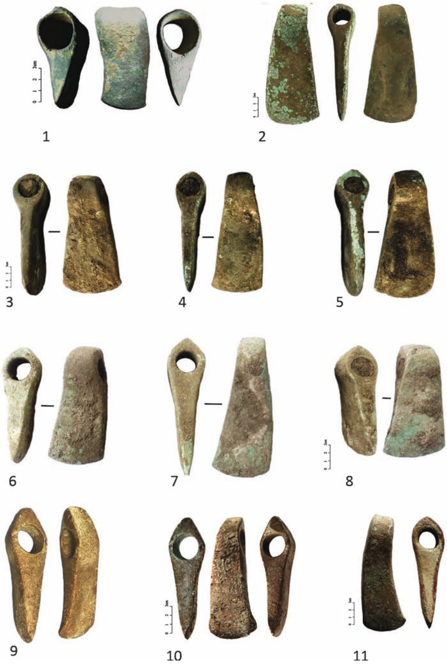
Fig. 5. New finds of the Samara type axes discovered in Ukraine. 1-8- Cherkasy region, 9 – Kharkiv region, 10 -Novi Petrivtsi, Kyiv region, 11 –Vinnytsia region.