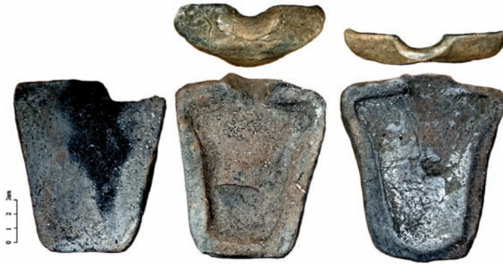
Fig. 6. Ceramic casting found near the town of Fastiv, Kyiv region.

tradition. The evidence of the local production of axes is the finding of several two-part closed casting forms. The first one was made in 1893 by V. Khvoika at the Kyrylivska Hora site situated within modern Kyiv, whilst the second one was made in 2022 near the town of Fastiv (Fig. 6). The most probable source of metallurgical raw material used by the craftsmen of the Sofievka local group is the Skvira deposits (Pavliuk and Pavliuk 2009b) of native copper and copper sandstone located 150 km to the south-west from the closest Sofievka site. At the end of their use, most of the copper items of the Sofievka culture were deposited as grave goods. According to material gathered by V. Klochko, 150 of the 202 known Sofievka metal objects were found within cremation burials (Klochko 1995, 205).