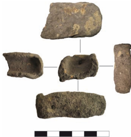
Fig. 4. Ceramic casting mould collected on the surface of the Tripillia BI site Tashlyk.