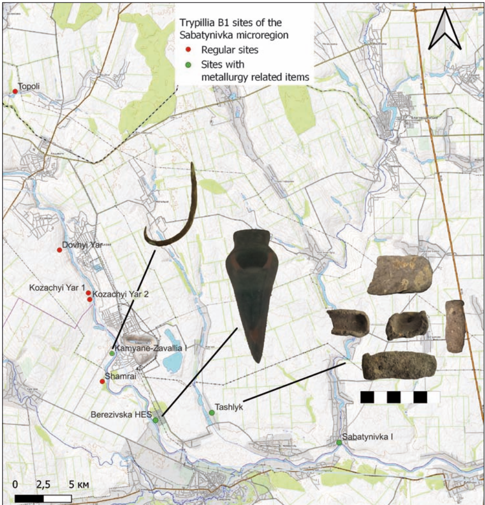
Fig. 3. Trypillia B1 sites of the Sabatynivka microregion located near native copper deposits of the Chemerpil area. Map after Kiosak and Lobanova 2021, modified by author

The oldest metal objects found in the region so far are the Vidra type axe from the cultural layer of the Trypillia B1 site Berezivska HES (Ryndina 1970, 19), a Pločnik type axe (Klochko et al. 2020, 12) found near the famous Trypillia BII-CI mega-site of Nebelivka (Gaydarska 2020), the Ariuşd type axes found near the village of Lysianka and within the Orativ district, and a Coteana type flat axe found near the town of Bohyslav.