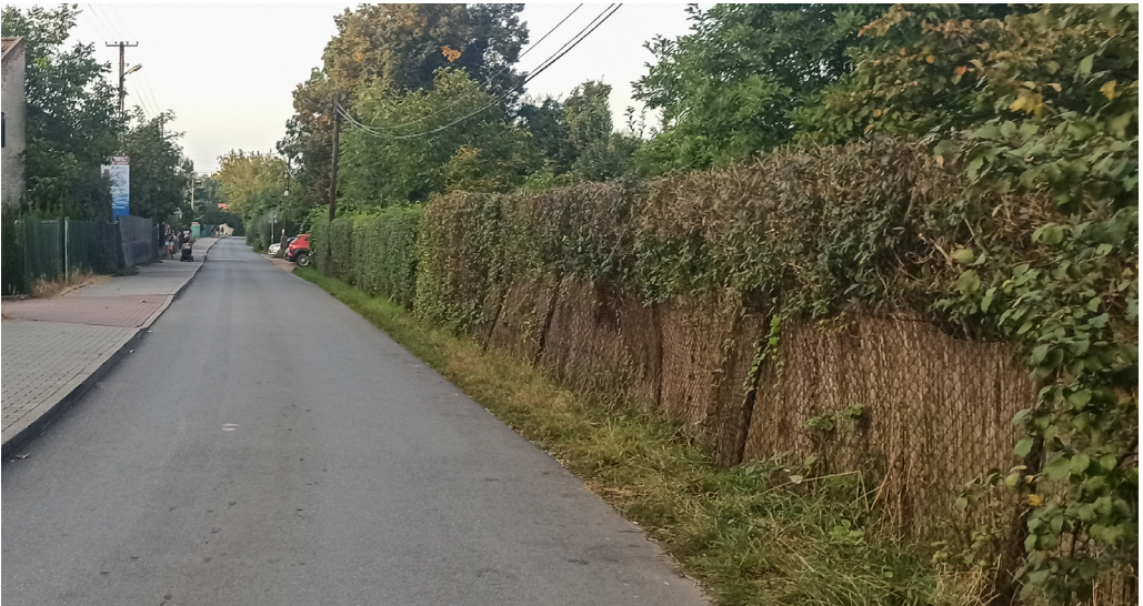
Figure 3. Typical habitat of P. nana in Poland: urban greenery adjacent to an allotment garden complex.

The first adult individuals were observed in the middle of July. The emergence period was extended, with nymphs still occurring up to September 20 (Boguchwała; W. Guzik, T. Mazurkiewicz), while the peak of adults was recorded in mid- to late September (see Table 1). The extreme observation dates recorded for the species were: 14 July (Warszawa; M. Brodacki) and 16 July (Kraków; Sz. Mazgaj), as well as 1 November (Krosno; P. Guzik) and 10 November (Warszawa; M. Radzikowski and R. Szulc).