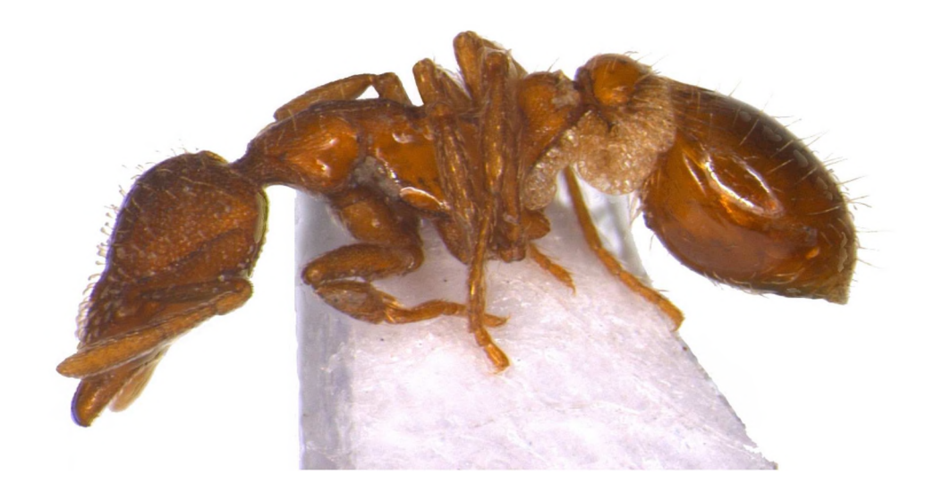
Fig. 2. Lateral view of Pyramica baudueri.

S. rogeri Emery, 1890. Among them P. baudueri is one of the most wide-spread and most common dacetine species in Europe. Its known distribution range covers continental France (Bolton 2000, Radchenko 2007), the Channel Islands (Radchenko 2007), Switzerland (Bolton 2000, Braschler 2002), continental Spain (Espadaler 1997, Bolton 2000, Radchenko 2007), the Balearic Islands (Epadaler 1997), continental Italy (Bolton 2000, Radchenko 2007), Corsica (Bolton 2000), Sardinia (Bolton 2000, Radchenko 2007), Sicily (Radchenko 2007), Malta (Radchenko 2007), Tunisia (Bolton 2000), Morocco (Bolton 2000), Greece (Agosti & Collingwood 1987, Radchenko 2007), Croatia (Bračko 2006), Macedonia F.Y.R. (Radchenko 2007), Montenegro (Petrov 2006), Hungary (Gallé et al. 1998), Turkey (Bolton 2000, Radchenko 2007), and Armenia (Arakelyan 1994).