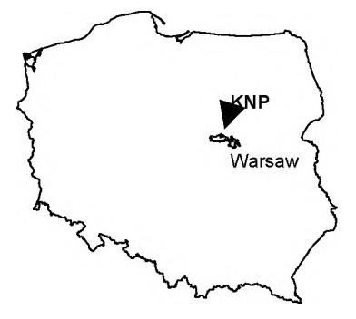
Fig. 1. Outline map of the Kampinos National Park with plotted 10-km UTM grid system.

Although the land surrounding the Kampinos Forest was early colonized by humans, due to its very fertile soils, the area of today's national park was inhabited quite late. The inland dunes, with their poor sands, did not attract agriculture, while mires and swamps restricted penetration of the inner parts. The first immigrants arrived around 1750 and settled on the most elevated ground. Their major occupation was clearing the forests. The settlers introduced new land management practices, with regular systems of drainage ditches and dikes protecting houses from flooding. Thus, two types of farming developed parallel in the Park's territory: an extensive and smaller scale type inside the forests on fens and poor sandy soils, and more intensive, with larger portions closer to the river, on richer alluvial soils (Heymanowski 1966).