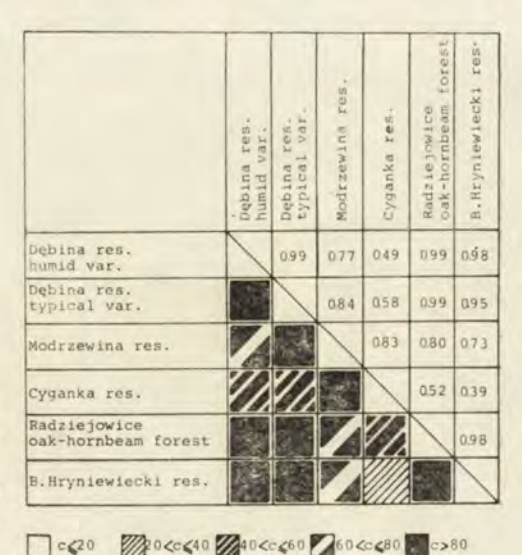
Fig. 2. A diagram of similarity in dominance structure (c) of elaterid communities in the linden-oak-hornbeam forests (Tilio-Carpinetum) and thermophilous oak forests (Potentillo albae-Quercetum) of the Mazovian Lowland.

In order to capture similarity of dominance structure in wireworm communities of the studied sites, the Morisita index (c) modified by Horn was applied. It was found out that in soil of the studied plots of linden-oak-horn-beam forests there occurred, on the whole, one type of community. In the moist variant of typical linden-oak-hornbeam forest and in typical linden-oak-hornbeam forest in the Dębina reserve, in the linden-oak-hornbeam forest