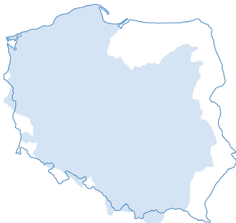
Figure 1. Boundaries of Poland as of 1136 and 1945

towards the east. It was considered that decisions as regards the western border would be taken at a peace conference in which the Western Powers would be playing a decisive role. It was also assumed that a more optimal solution than a return to the Republic's western borders of 1772 – plus limited access to the sea along with Gdańsk – would be unlikely to emerge. The bold vision postulated by Jakimiak seemed like pure fantasy in the circumstances of the political situation at the time (Kochanowski & Kosmala 2013).