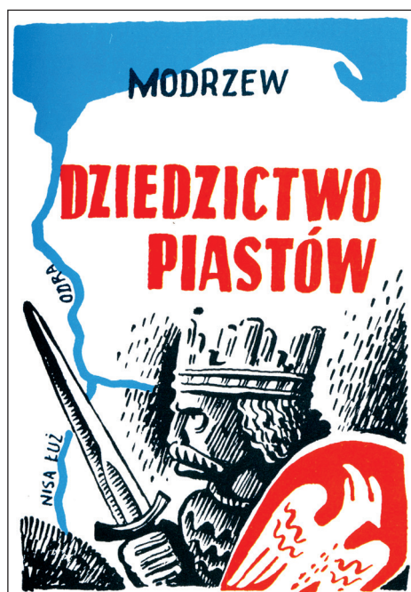
Figure 3. Heritage of the Piast dynasty (book cover picture)

and multi-stranded justification of the need for Poland to gain Germany's eastern lands up to the Oder-Neisse Line (Fig. 3). A total of 15 geopolitical, demographic, ethnic and economic/social justifications were in fact advanced, though these can be seen to be of disparate value from the substantive point of view. While many sound rational enough, some at least are loaded with exaltation and naive optimism (Modrzew 1944: 6-7).