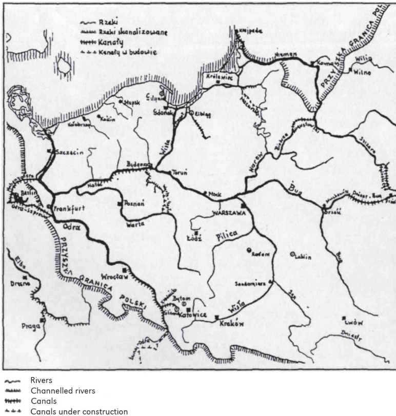
Figure 2. The future border of Poland after Lech Neyman

Another courageous visionary was Leszek Prorok (who went by the pseudonym ‘Modrzew’, meaning ‘The Larch’). Prorok offered an incisive