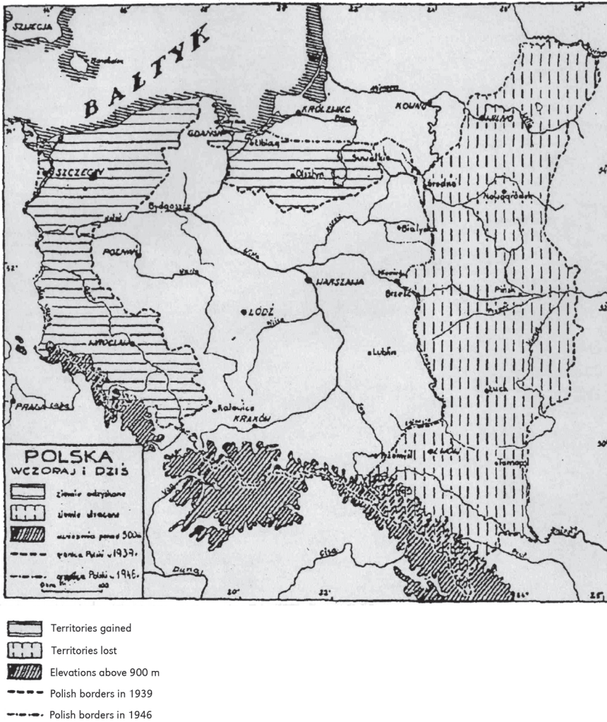
Figure 6. "Poland yesterday and today"

The facts presented here attest to the major consequences of the Potsdam Conference, which led to the emergence of a compact