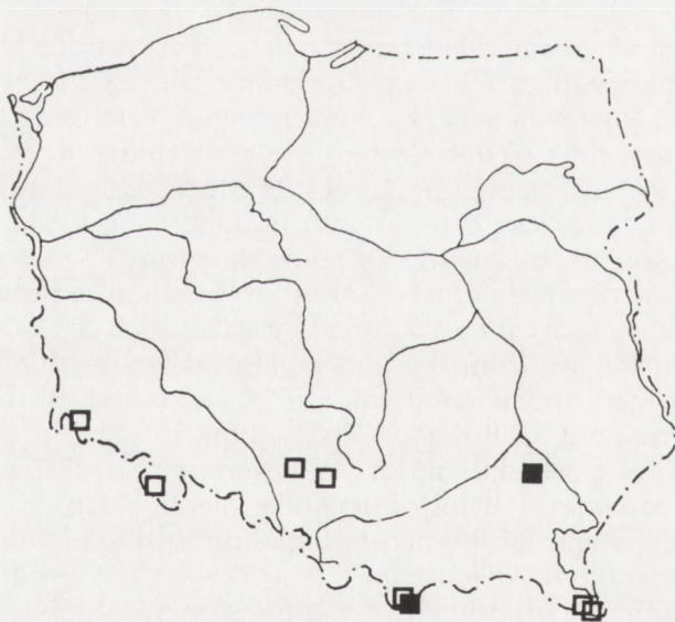
Fig. 2. Localities of Harpagoxenus sublaevis (NYL.) in Poland (□ – literature data, ■ – new data).

In Poland, H. sublaevis is recorded from just a few sites in the southern part of the country: Upper Silesia, the Western Sudeten Mts, the Bieszczady Mts, and the Tatra Mts. (PISARSKI 1975). It has been found in mixed colonies with L. acervorum (NOVOTNY 1931, STAWARSKI 1961, PARAPURA and PISARSKI 1971) or with L. muscorum (NOVOTNY 1931). The present paper gives a second site of the species in the Tatra Mts. and reports its occurrence in yet another region of Poland, namely in the Sandomierska Lowlands (Fig. 2).