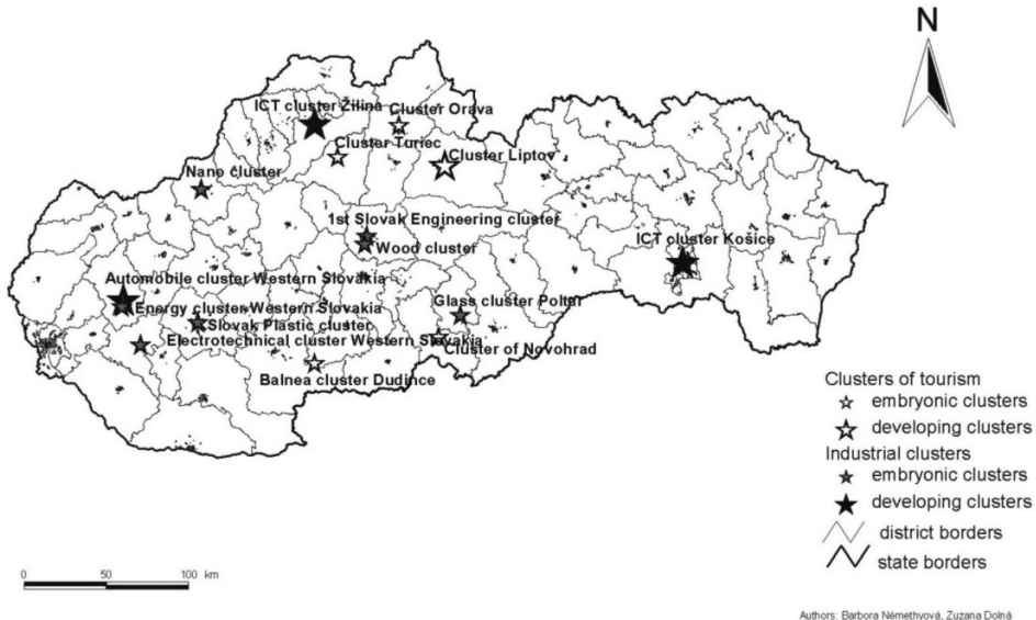
Figure 2. Localization of existing clusters in Slovakia

Automobile cluster—Western Slovakia with the seat in Trnava was established in November 23rd, 2007 by Trnava self-governing region and the town of Trnava. Its vision is to develop a prestigious and modern base for automobile industry in western Slovakia until 2012. It is supposed to ensure not only the production of automobiles, but also the development of science, research and education for industry, transfer of technology and innovative processes, support of supply chains and quality of human resources. Nowadays, it provides consulting, arranges meetings, symposiums, mutual purchase and marketing and team solutions of problems for its 28 members. It participates actively on projects AC Centrope, Autoplast, Autoclusters, AutoNet and Simatic.