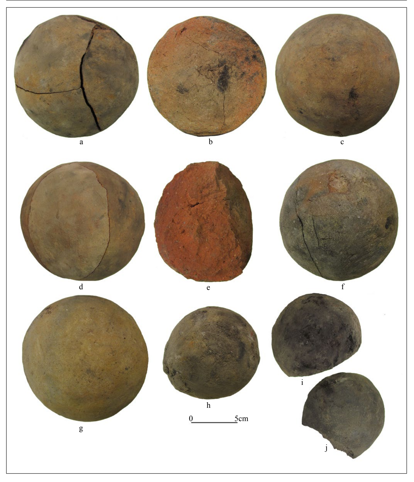
Fig. 3. Olsztyn, the High Turret, a-j: clay cannonballs and their fractures/cross-sections.

With regard to its numerical strength, the best represented group is the ammunition with calibres between 12.9 and 14 cm. It can be assumed that it was designed to be used for several different cannons. This group includes as much as 85% of the entire assemblage. The next group, represented by both types of raw materials, was designed for barrels with calibres of 11.5-12 cm. Finally, the last group encompasses projectiles for the lightest cannons with calibres of