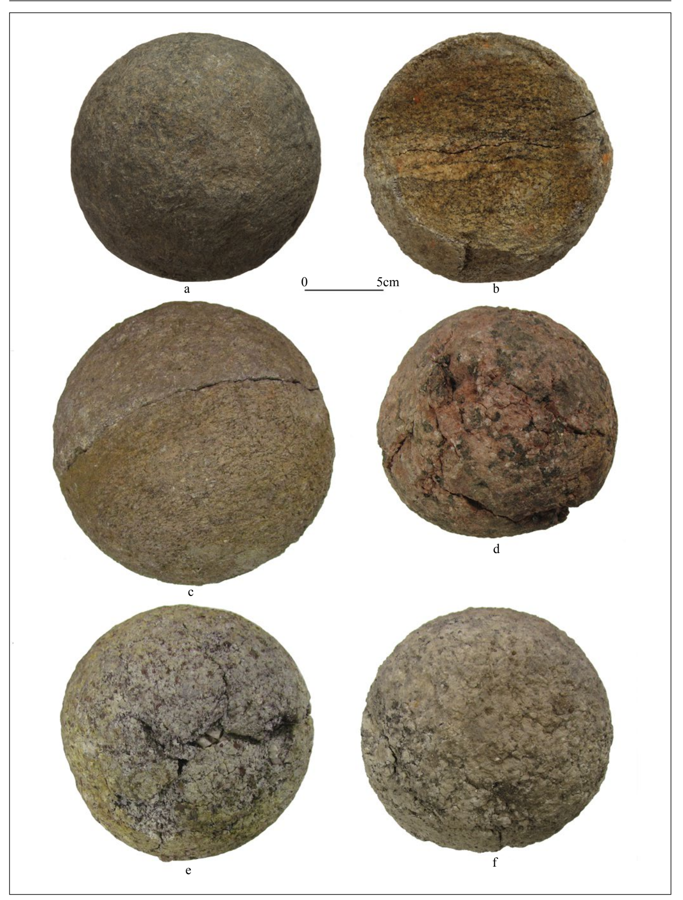
Fig. 1. Olsztyn, the High Turret, stone cannonballs: a. diabase; b. gneiss with layers of biotite, evident directional texture and cracks appearing along laminas with biotite; c. fine-grained (phaneritic) granite-gneiss, rich in biotite; d. coarse-grained Uthammar granite with large potassium feldspars; e. leucocratic granitoid with feldspar pegmatite, strongly weathered; f. strongly weathered Sala granite. A-f Photo P. Czubla and P. Strzyż.