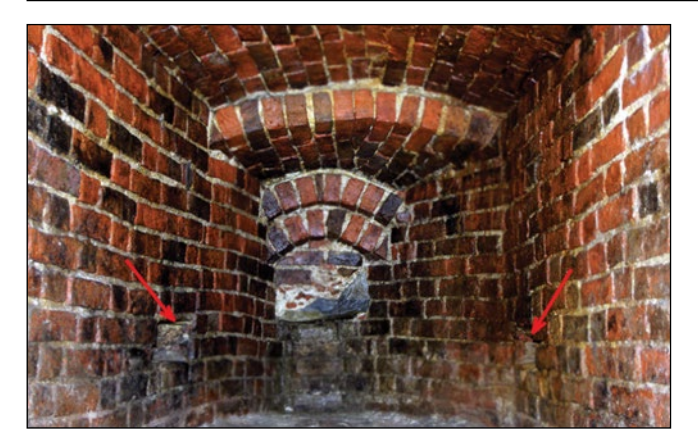
Fig. 5. Olsztyn, the High Turret. Shooting niche, arrows mark openings for beams supporting firearms. After Kaczyński and Mackiewicz 2014, Fig. 20.