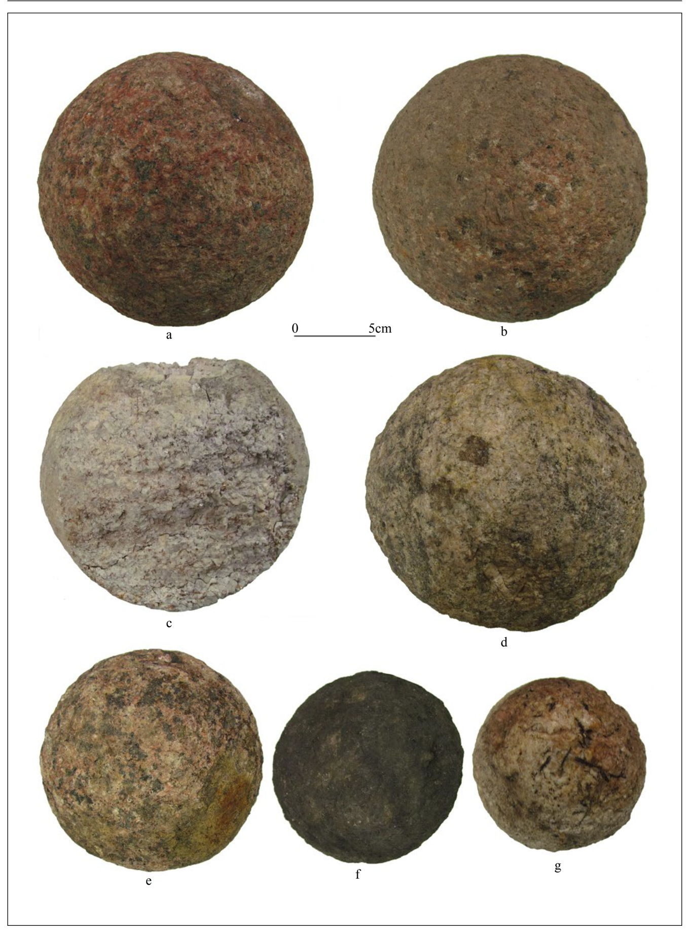
Fig. 2. Olsztyn, the High Turret, stone cannonballs: a. Aland rapakivi granite b. red Scandinavian granitoid; c. weathered granitoid with pegmatite (almost only feldspars and biotite); d. fine-grained (phaneritic) granitoid; e. Siljan rapakivi granite; f. fine-grained (phaneritic) granitoid; g. pegmatite with large sheet-shaped crystals of biotite. A-f Photo P. Czubla and P. Strzyż.