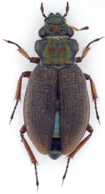
Fig. 7. General habitus of Ochthebius foveolatus Germar, 1824.