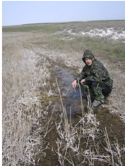
Fig. 4. Habitat of M. paradoxum in Volgograd Oblast', where A. Prokin collected specimens in 2008.