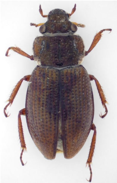
Fig. 5. General habitus of Ochthebius nonaginta Jäch, 1998.

Russia (ST): 50°37'38.8"N, 54°28'55.4"E, 190 m, Orenburg Oblast', Sol'-Iletsk District, 11 km SW Troitsk, steppe, hills, in slow stream, 18–21 May 2012, leg. S. Litovkin, 1 ex. (SLC); 51°02'36"N, 55°36'12"E, 180 m, Akbulak District, 3 km N Akbulak, steppe, pool, 20–21 Apr 2013, leg. S. Litovkin, 1 ex. (SLC).