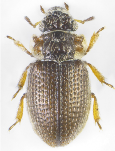
Fig. 1. General habitus of Aulacochthebius narentinus (Reitter, 1885).

This is the second record from Russia, and the first record from the central part of European Russia (CT).