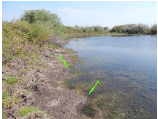
Fig. 2. Habitat of A. narentinus in Samara Oblast' Arrows indicate actual choriotope.