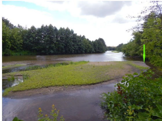
Fig. 8. Habitat of O. foveolatus in Samara Oblast'. Arrow indicates actual collecting site.