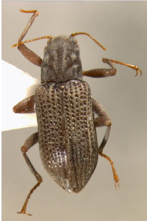
Fig. 12. General habitus of Stenelmis koreana Satô, 1978 from Khabarovsk Kray, ZMUM.