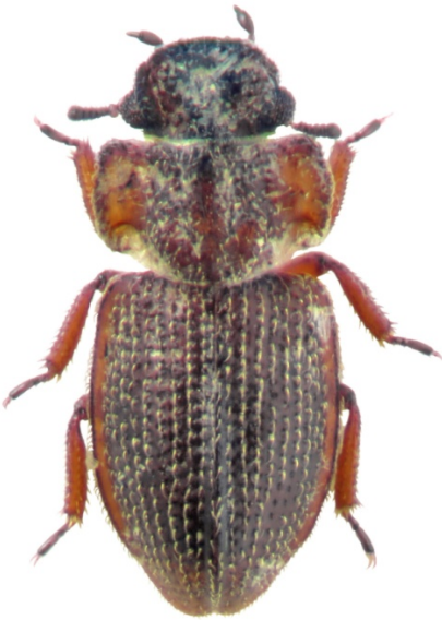
Fig. 3. General habitus of Micragasma paradoxum Sahlberg, 1900.

Makarov et al. (2009) recorded this species from the vicinity of Lake Elton under the name Micragasma cf. paradoxum Sahlberg, 1900.