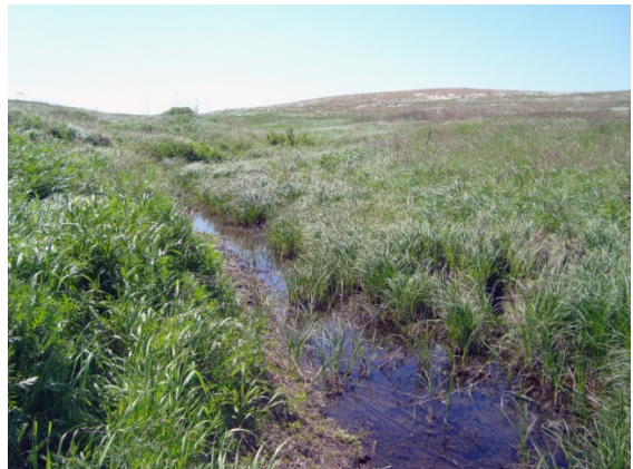
Fig. 6. Habitat of O. nonaginta in Orenburg Oblast' (11 km SW Troitsk).