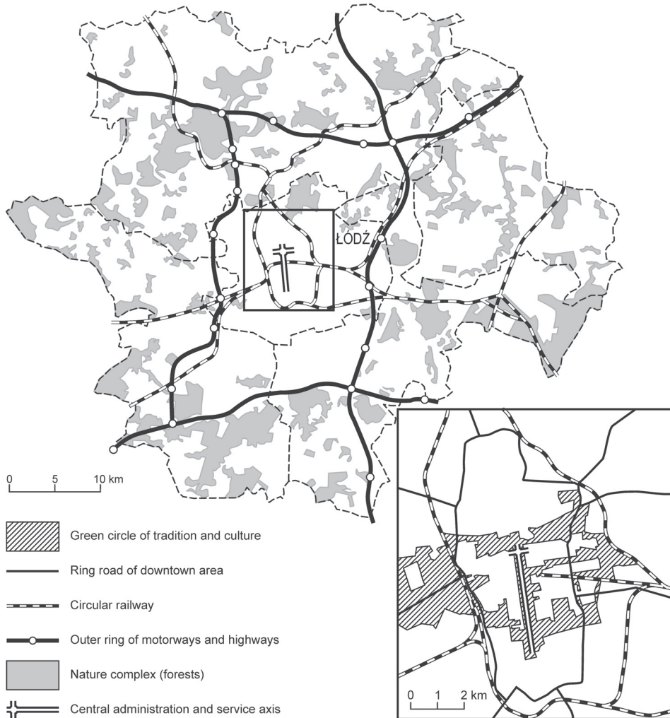
Figure 2. The concentric structure of Łódź Metropolitan Area.