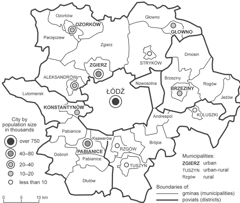
Figure 1. Administrative division of Łódź Metropolitan Area

four poviats (districts) surrounding it: Zgierz, Pabianice, Łódź East and Brzeziny poviats (districts) (cf. i.a. Wolaniuk 1997; Liszewski 2005; Marszał & Pielesiak 2008; Feltynowski 2009; Jewtuchowicz & Wójcik 2010; Suliborski & Przygocki 2010). A number of works cited in this paper demonstrate that thus delimited ŁMA constitutes a fairly compact and functionally linked area with good transport accessibility, where the majority of municipalities are characterized by a high level of urbanization and a dominant share of non-agricultural functions (cf. Pielesiak 2012b: 173).