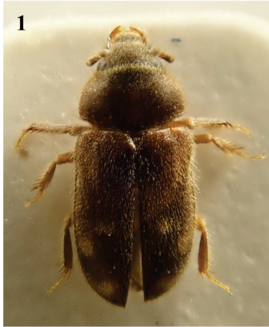
Fig. 1. Heterocerus atroincertus Charpentier, 1965, male (Gumara River).

Distribution. Botswana, Kenya, Malawi, Mozambique, South Africa, Tanzania, Zaire, Zambia, Zimbabwe (Mascagni & Monte 2009, Mascagni 2012).