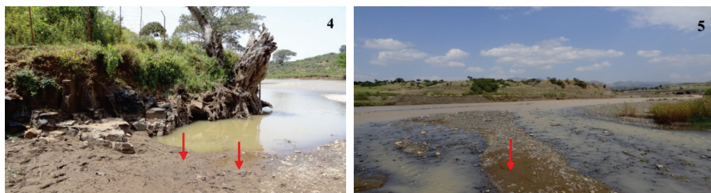
Figs 4–5. Habitats of Heterocerus spp. in Ethiopia (Amhara region). 4 – Gumara River ( Heterocerus atroincertus and Heterocerus tibesticola ); 5 – Rib River ( Heterocerus tibesticola ).