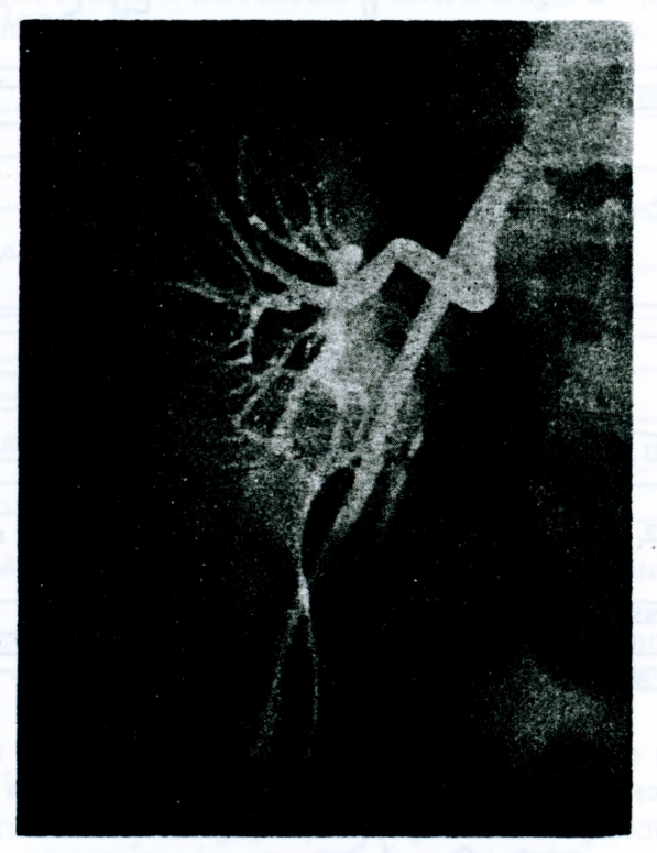
Fig. 4. Arteriography of transplanted kidney.

On 20th May 1966 the patient was discharged.