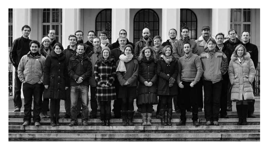
Fig. 1. Staff of the LBI ArchPro and PhD students of the Initiative College for Archaeological Prospection in Vienna

SMEs. Partners are the Norwegian Institute for Cultural Heritage Research (N), Vestfold County administration (N), Province of Lower Austria (A), Archaeological Contract Service of the Swedish Central Heritage Board (S), Roman-Germanic Central Museum in Mainz (D), Vienna University of Technology (A) with the Institute for Computer Graphics and Algorithms and the Institute for Photogrammetry and Remote Sensing, University of Vienna with the Vienna Institute for Archaeological Science and the Department for Prehistoric and Historical Archaeology (A), IBM VISTA laboratory at the University of Birmingham (UK), Airborne Technologies (A), Central Institute for Meteorology and Geodynamics (AUT), and 7reasons Medien GmbH. Collaboration agreements exist with academic institutions, museums, as well as manufacturers of latest measurement technology, prospection sensors and survey systems.