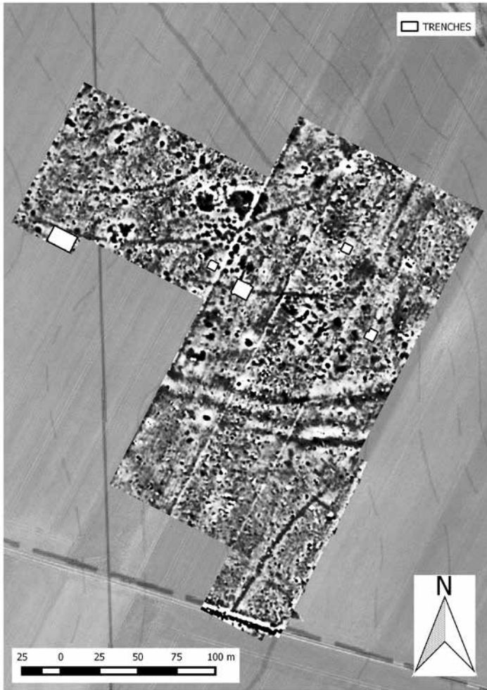
Fig. 1. Samborowice, site 13, Racibórz district. Plan of magnetic gradiometry survey ( -2nT/2nT , light to dark) by P. Dułęba, J. Soida, P. Wroniecki

finds. As a side effect, the results of the survey clearly showed the cadastral divisions due to small field parceling. The acquired geophysical data was visualised in a grayscale convention. Geophysical measurements were processed in the TerraSurveyor and Geoplot 3 software.