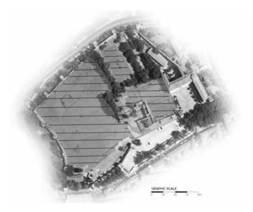
Fig. 1. Area covered by the GPR survey (marked with straight lines)