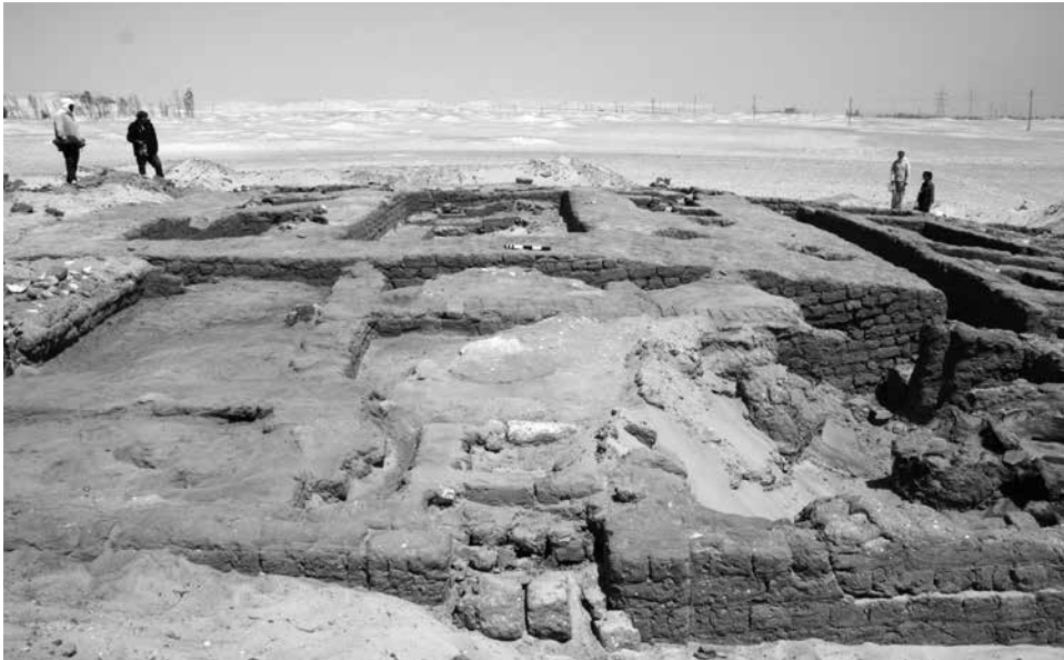
Fig. 3. Excavated North tower with staircase, TG2002.K2

2015). The magnetic susceptibility of volume mud bricks was comparatively low (values range from 0.3\text{--}0.7 \times 10^{-3} SI), but the adjacent sand consisted of diamagnetic quartz and revealed even negative kappa values. Such conditions deliver an ideal background for magnetometer surveying in Egypt (e.g., Forstner-Müller et al. 2010).