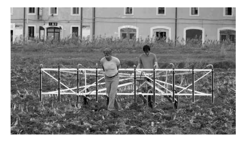
Fig. 2. Magnetic survey at Ad Medias using the LEA MAX with 10 gradiometer probes; four individual suspended wheels reduce the effect of the heavily ploughed fields