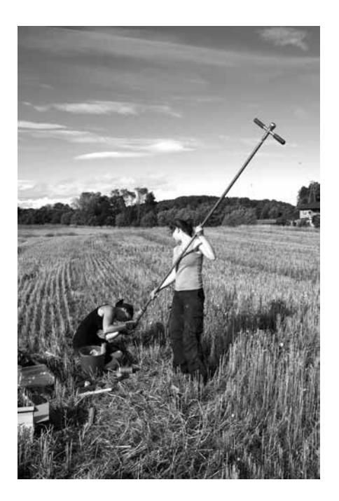
Fig. 1. Using a liner sampler to evaluate the interpretations of GPR and magnetic data sets

natural origin. In order to investigate these non-archaeological elements of the archaeological landscape in more detail, a pilot study was conducted, dealing specifically with the analysis of palaeoenvironmental information hidden in large-scale, high-resolution AGP data.