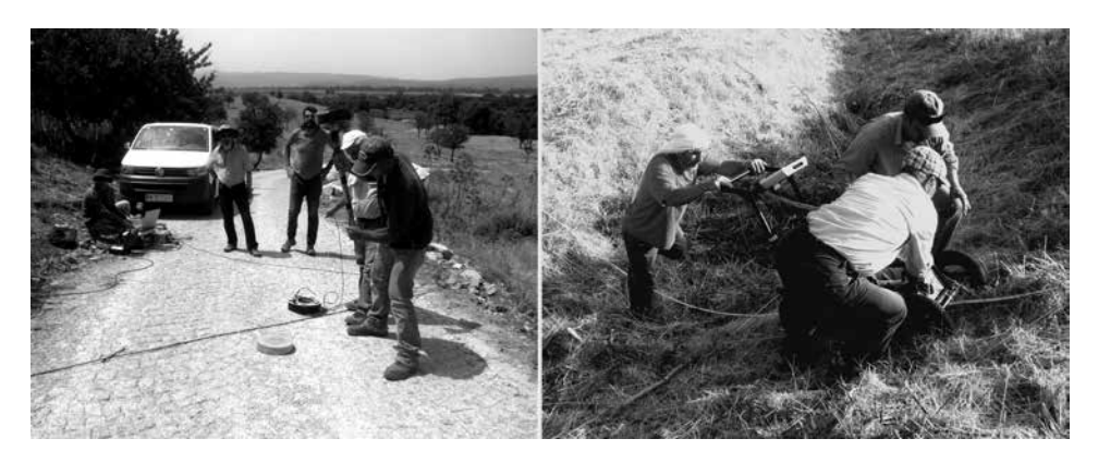
Fig. 1. Refraction seismic fieldwork (left) and GPR fieldwork (right) in Ephesos