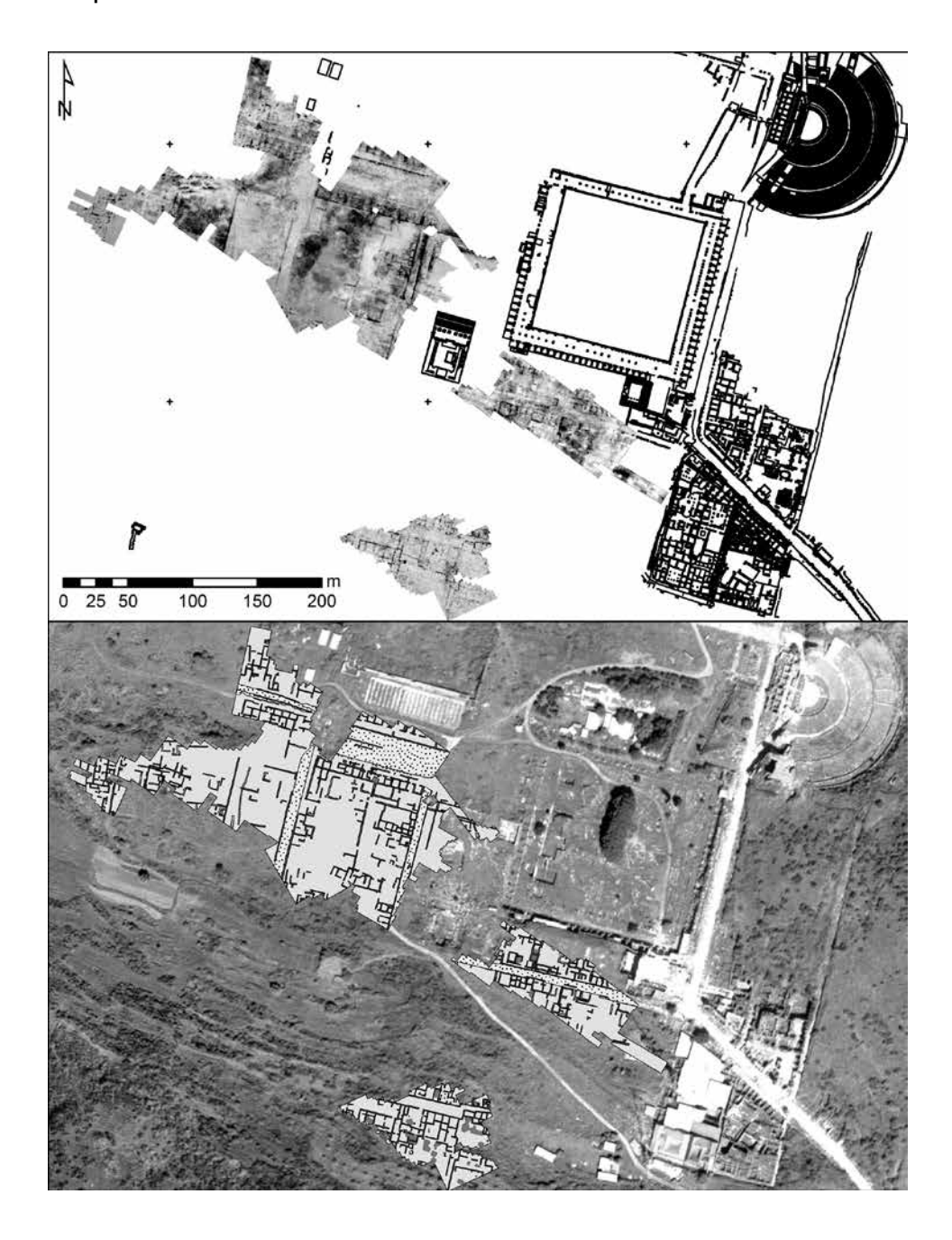
Fig. 3. The results of GPR prospection in the area of the Serapeion in Ephesos above (black: high amplitudes – reflective, white: low amplitudes – absorbent) and the archaeological interpretation below