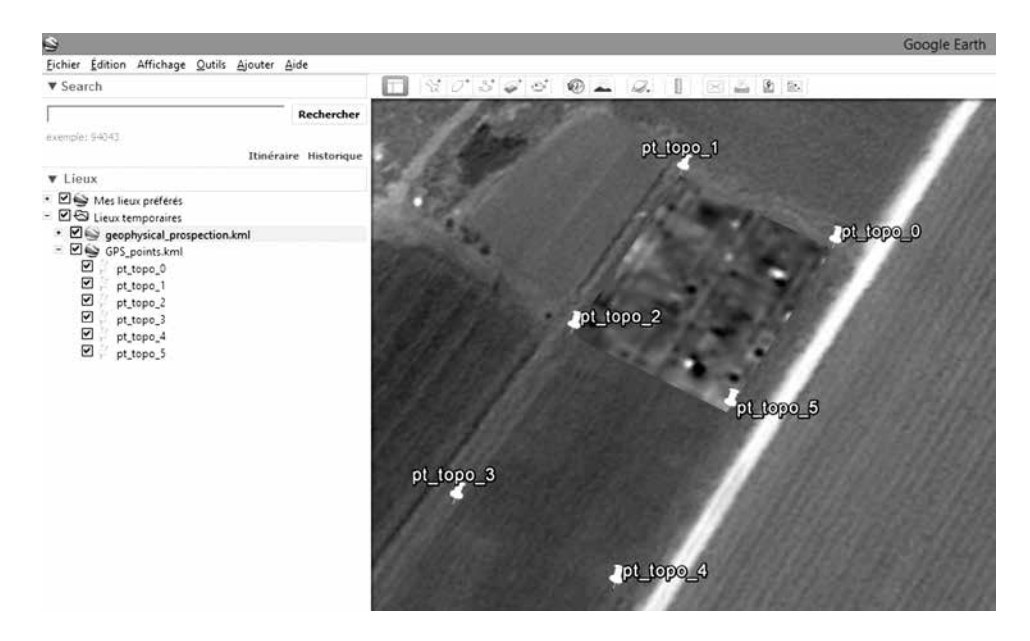
Fig. 2. WuMapPy to Google Earth integration example