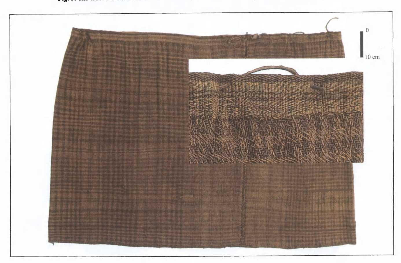
Fig. 6. The wool skirt with detail of the waistband.

not used during this period. Evidence of sewing generally appears in connection with repairs or reuse, and is clearly different from other types of textile techniques. For instance, the sewing thread used is often coarser as well as in a different colour than the thread used in the weave, like in the case of the seam in the Huldremose skirt. Perhaps sewing was not considered important compared to other textile techniques, but it was definitely not because they were poor craftsmen.