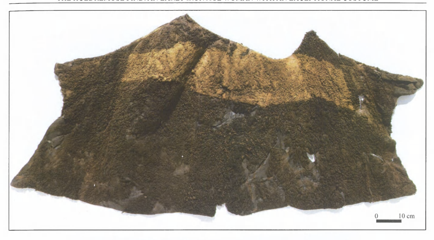
Fig. 3. The outer skin cape seen from the fur side.