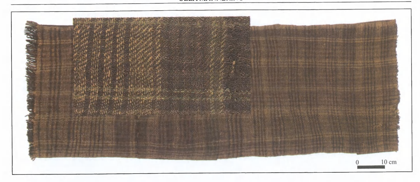
Fig. 5. The wool scarf with detail of the weave.