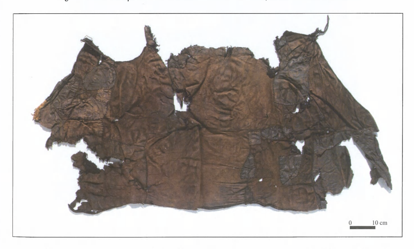
Fig. 4. The inner skin cape seen from the flesh side with its many patches.

different purposes such as blankets or cloaks, or were perhaps draped around the body.