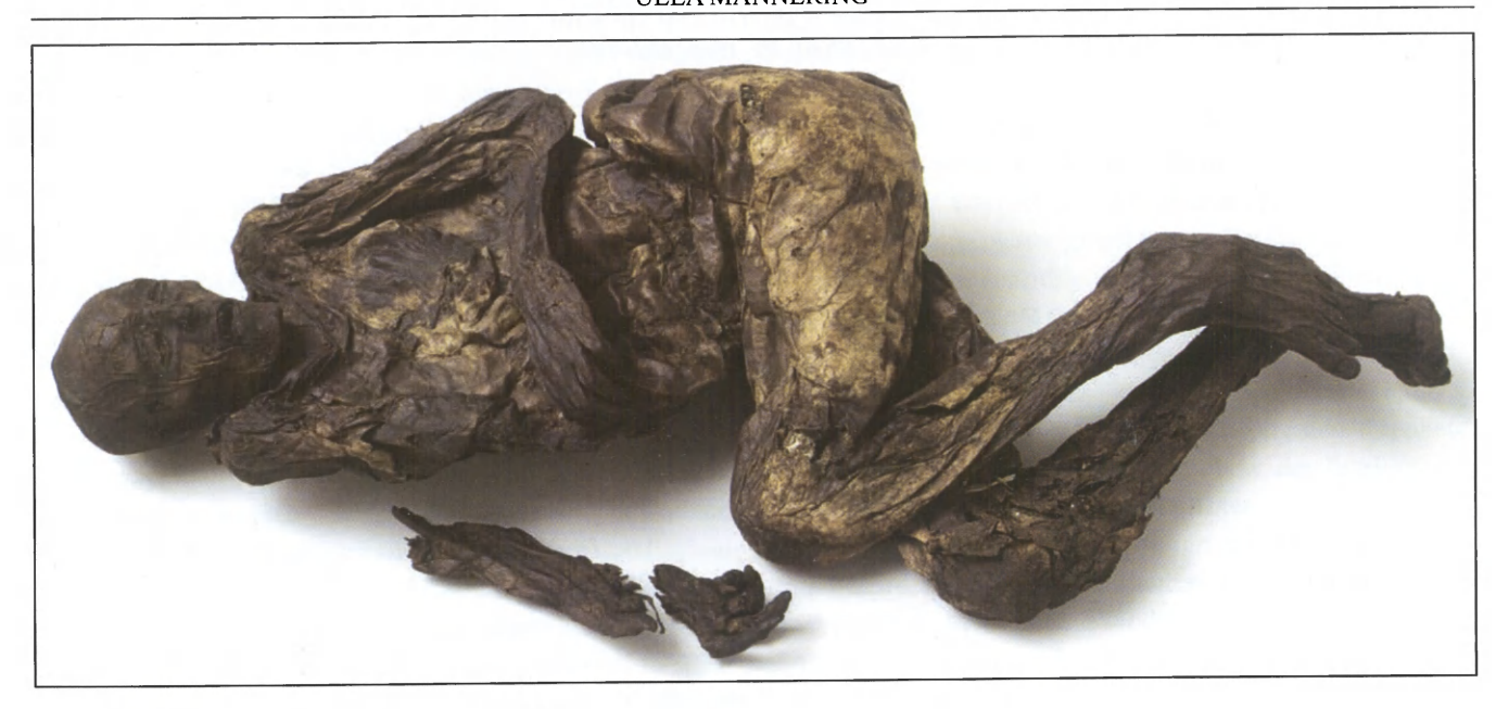
Fig. 1. The body of the Huldremose Woman.