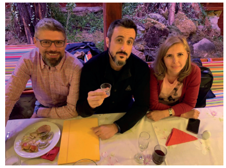
Figure 3. Warsaw Regional Forum Towards spatial justice-territorial development or marginalization , 16-18 October 2019