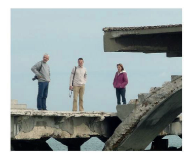
Figure 5. Scientific seminar Central Europe – Socio-Economic Disparities, Rural and Regional Development, Bucharest, September 2008