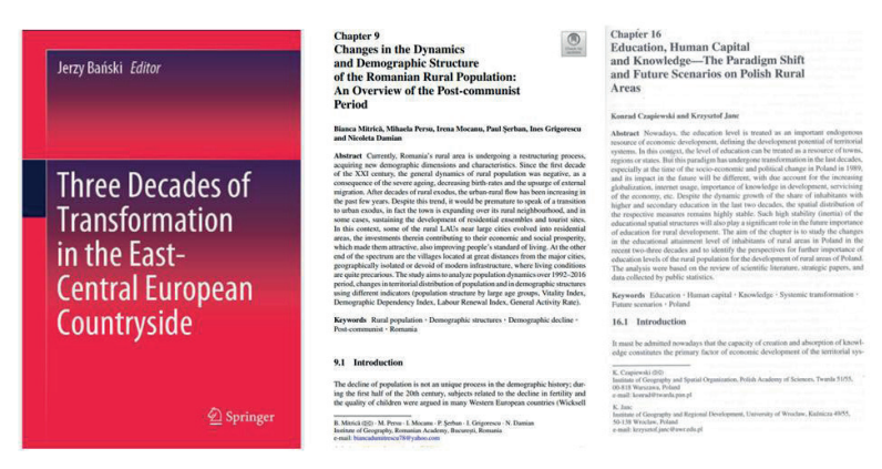
Figure 7. J. Bański (Ed.) (2019), Three Decades of Transformation in the East-Central European Countryside

Two chapters related to the thematic of the bilateral project on Internal peripheries in Polish and Romanian regions – role of endogenous and exogenous factors in their development processes were published in the book edited by Prof. Jerzy Banski Three Decades of Transformation in the East-Central European Countryside published in 2019 (Czapiewski & Janc, 2019; Mitrică et al., 2019) (Fig. 7).