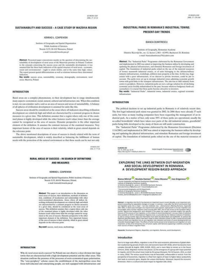
Figure 4. Scientific papers published in Europa XXI