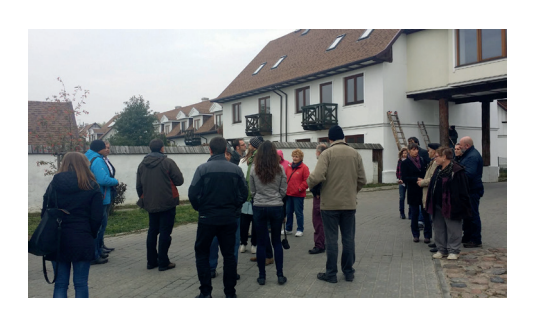
Figure 2. Warsaw Regional Forum Space of flows, 18-20 October 2017