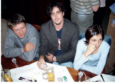
Figure 1. Warsaw Regional Forum Core and peripheral regions in Central and Eastern Europe, 5-8 October 2005

Some of the presentations presented at the Warsaw Forum were published in the Europa XXI journal, under the auspices of the Institute of Geography and Spatial Organisation (IGSO PAS) (Fig. 4).