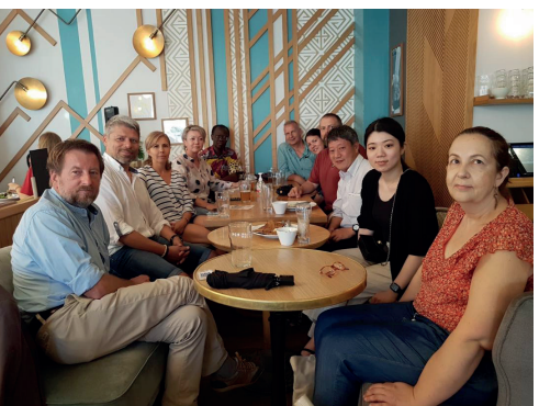
Figure 12. IGU Centennial Congress, Paris, July 18-22, 2022