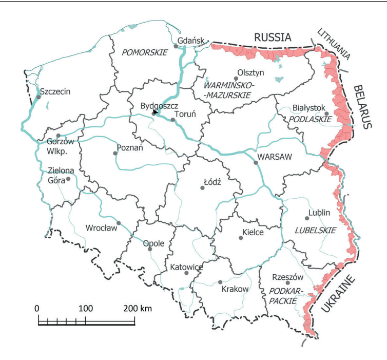
Figure 1. The study area – 77 gmina-level units of (local) administration (the names of the voivodeships within which they lie are given in upper case and italics, while the provincial/regional capitals are presented alongside dots on the map)

Basic information on the studied units is presented in Table 1. They covered 14,200 km<sup>2</sup> in total, i.e. less than 5% of the overall area of Poland. There were 507,000 people registered in these localities in terms of permanent residence (or less than 1.5% of the country's population). Among these, the largest urban centres (Przemyśl plus Bartoszyce, Braniewo, Hajnówka, Hrubieszów and Sokół-ka) concentrated around 150,000 people. More than half of these gmina -level units (47) had fewer than 5000 inhabitants each, and the smallest (the town of Krynica Morska, located by the border with Kaliningrad Oblast) had a mere 1100 inhabitants. Towns were present in the gminas in a total of 21 cases.