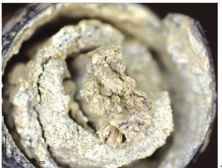
Fig. 1. Organic residues on the surface of metal artefacts and constituting their part: 1 – Residues of grass or cereals stuck to the surface of the hollow ankle ring, 2 – A fragment of wood found inside the saltalione spiral in the hoard from Wola Sękowa