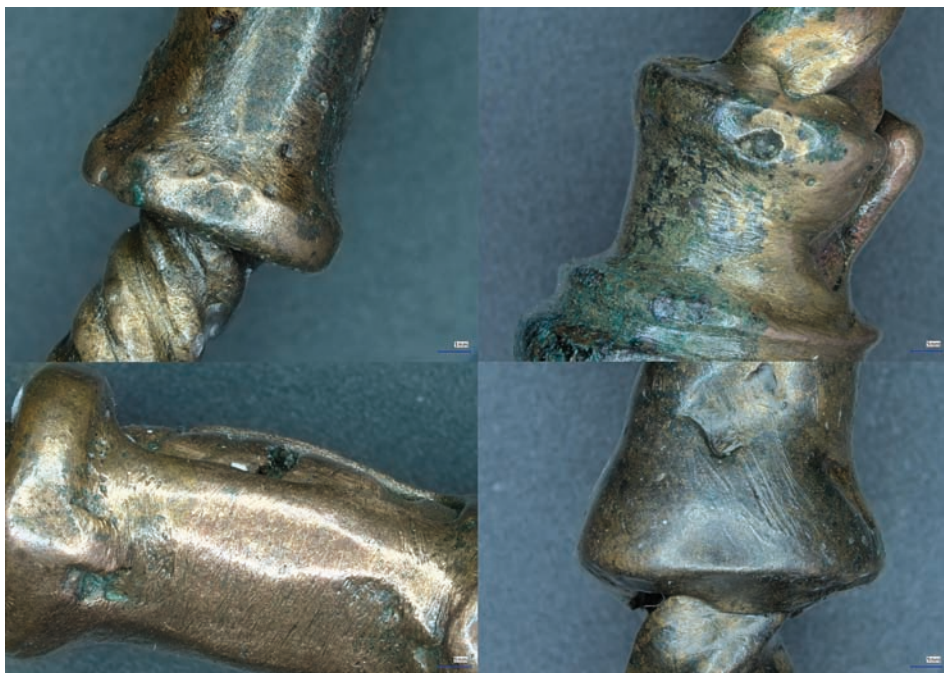
Fig. 3. Repair using cast-on technique on different necklaces from the Kaliska I hoard

grinding of broken elements. Bracelets from the hoards in Falejówka exhibit characteristic flattening and wear of ornamentation associated with intensive use (Nowak 2022, 82, fig. 37). The surfaces of folded tubes and knobs from the Sanok (Biała Góra) hoard are heavily worn. In this case, the rubbing of the external side of the objects against some type of surface (possibly fabric or animal fur) erased previous manufacture traces (Nowak 2022, 84-85, fig. 39-40). Additionally, in the case of these discussed hoards, traces related to the creation of ornamentation on bracelets and decorated plaques have been identified, including its imperfections (Nowak 2022, fig. 36: 3; 41: 7-8).