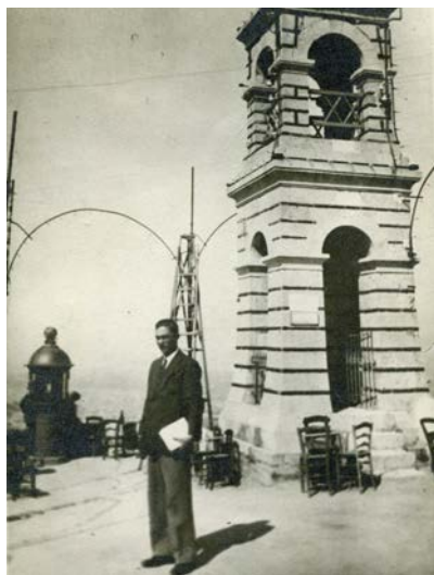
Fig. 10. Ivan Starchuk during his scientific travels in 1932.