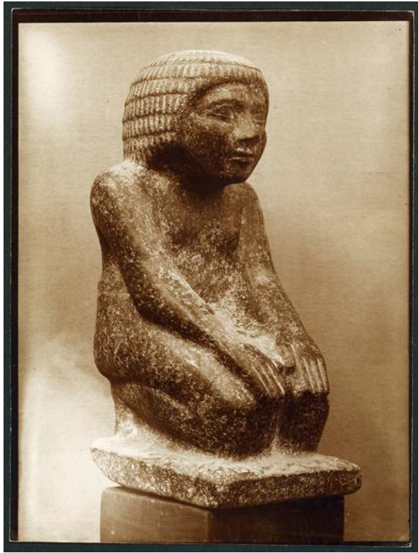
Fig. 3. Photo of an Egyptian sculpture from the collection of the Archaeological Cabinet of the University of Lviv. From the collection of the University Library of the Catholic University of Lublin.

and was rather rich (Fig. 3). The cited fragment leads to the thought that the lectures of the Professor of archaeology were interesting, well illustrated because otherwise paid lectures could not gather an audience.