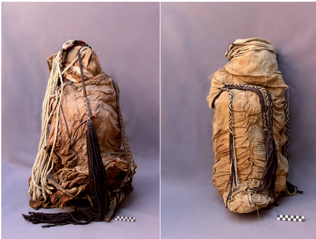
Fig. 2. Funerary bundles from the San Francisco cemetery; Burials 73 (with weaving tools stuck into the external shroud) and 74

bundle. The bodies of adults were dressed only in a loincloth, while children were placed naked within funerary bundles (Wanot 2021, 436-439).