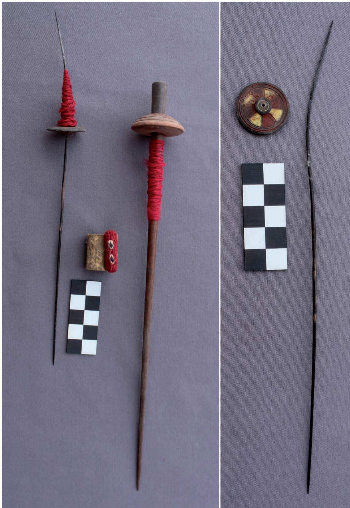
Fig. 6. Weaving toolkit from San Francisco with two spindles and leather thimble wrapped in a reed mat