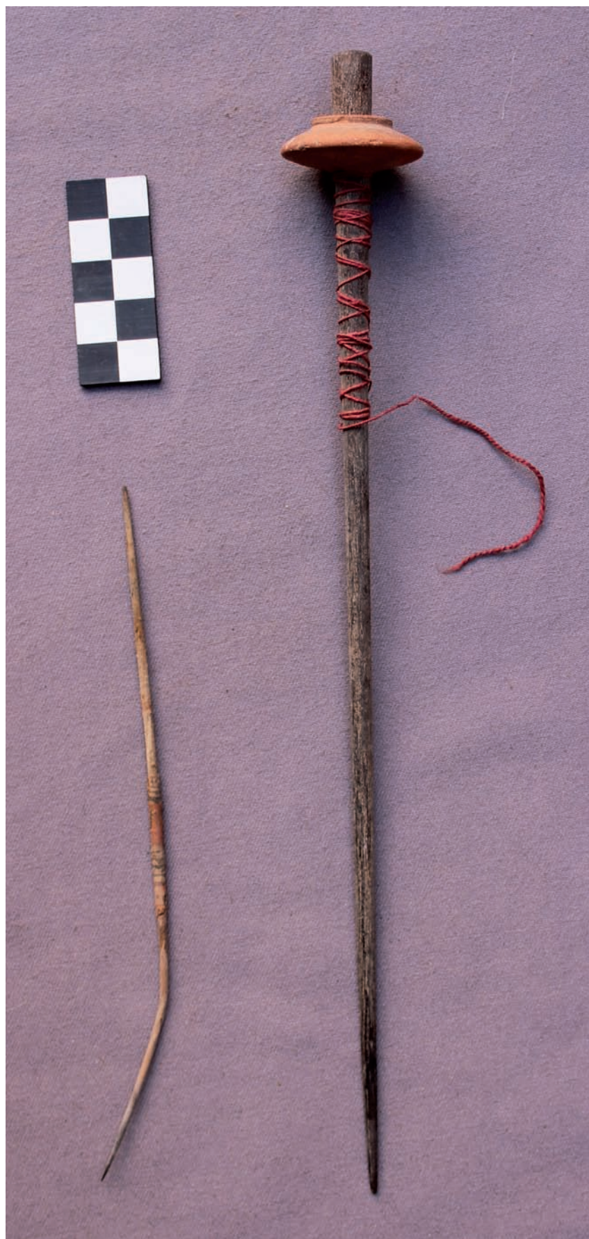
Fig. 8. Microscopic photos of the decorated spindle whorl included in a weaving toolkit from San Francisco