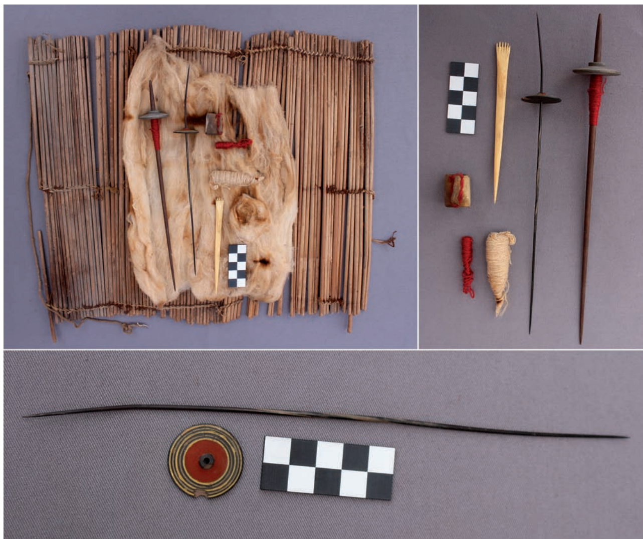
Fig. 7. Multi-element weaving toolset without an archaeological context from the San Francisco site

from the San Francisco cemetery performed in the Poznan Radiocarbon Laboratory in Poland (Tab. 1). The dating of a two pieces of camelid fibre from Burials 24 and 41 yielded the result of 410 \pm 30 BP and 360 \pm 30 BP. The dating of the third sample, collected from the internal layer of cotton constituting a funerary bundle from Burial 38, yielded the result of 375 \pm 30 BP. The chronological ranges obtained after calibration with OxCal v4.2.3 (Bronk Ramsey 2013) using the SHCal13 (Hogg et al. 2013) and the IntCal13 (Reimer et al. 2013) radiocarbon calibration curves prompt the conclusion that the San Francisco cemetery in the Yauca Valley functioned mainly during the Late Horizon (1438-1532 AD) and at the beginning of the Colonial period (Wanot 2021, 355-357). It is worth emphasizing, however, that taking for granted the ^{14}\text{C} dating of raw materials used for textile produc-