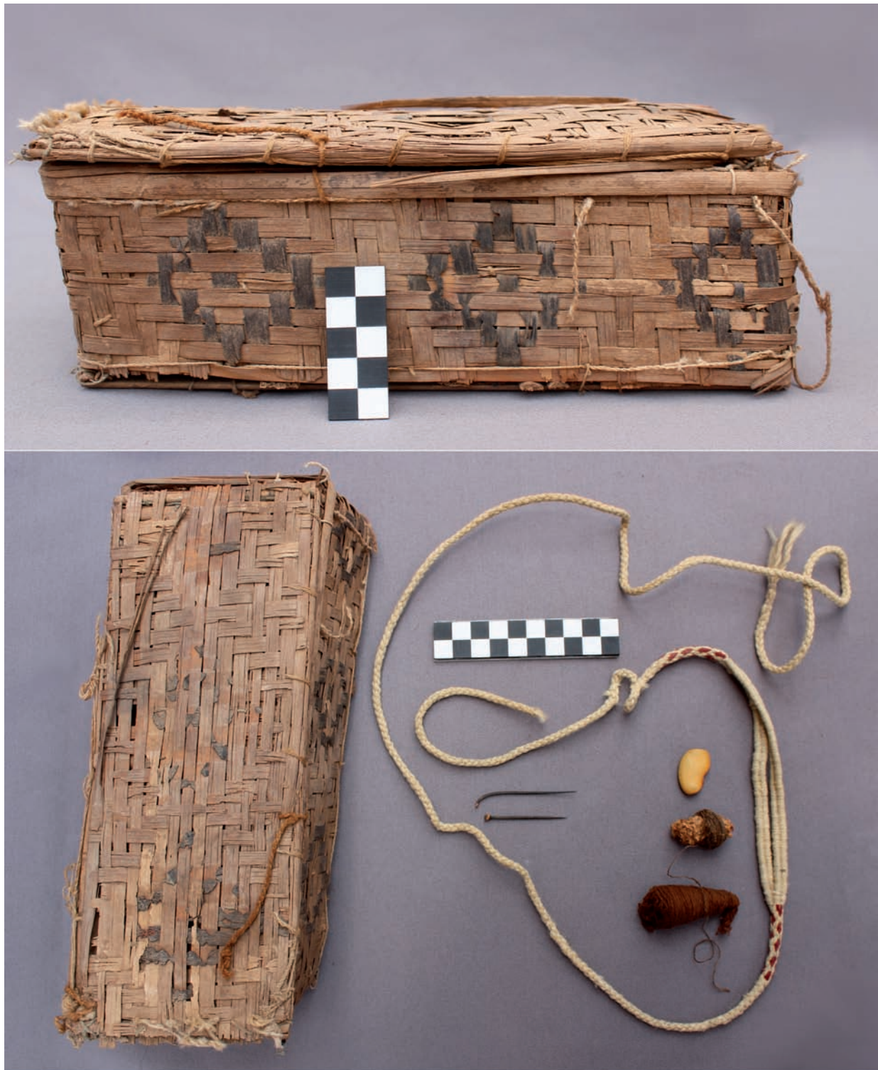
Fig. 4. Workbasket from Burial 40

fibres wrapped in a reed mat (Fig. 3). The reed elements of the mat were combined with a straight and herringbone stitch of light and dark brown threads from camelid fibre; a crossed-warp string – tipped with a characteristic knot-shaped tassel – was used to tie the mat.