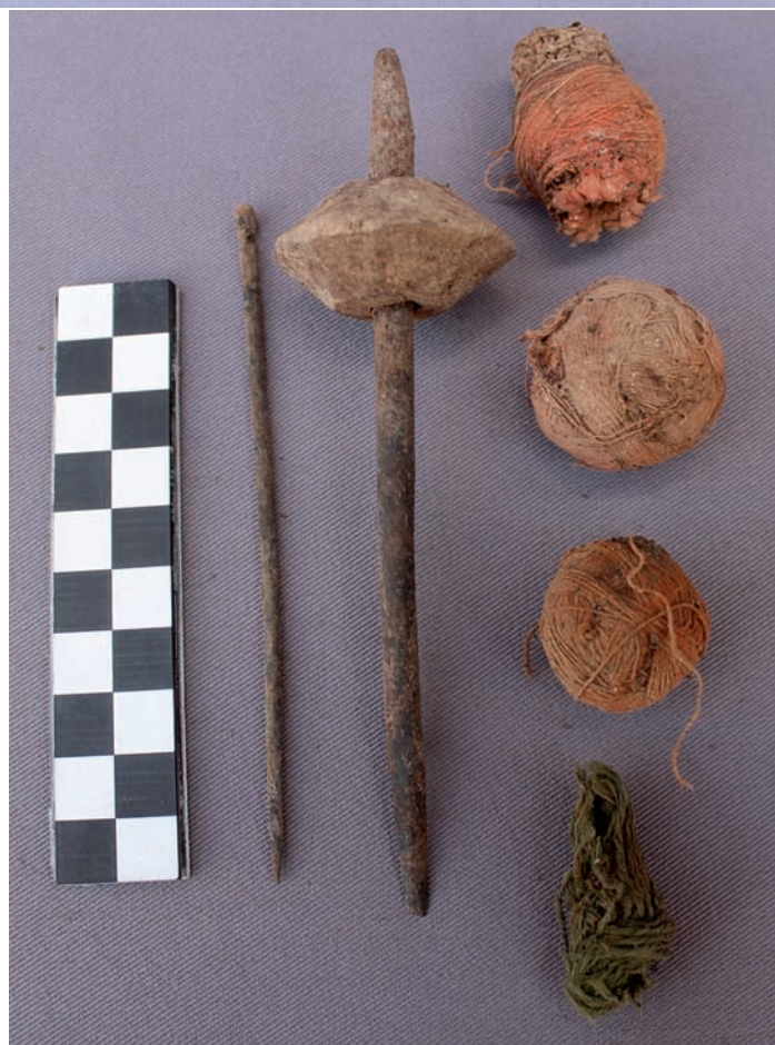
Fig. 5. Weaving toolkit from San Francisco wrapped in an unadorned textile