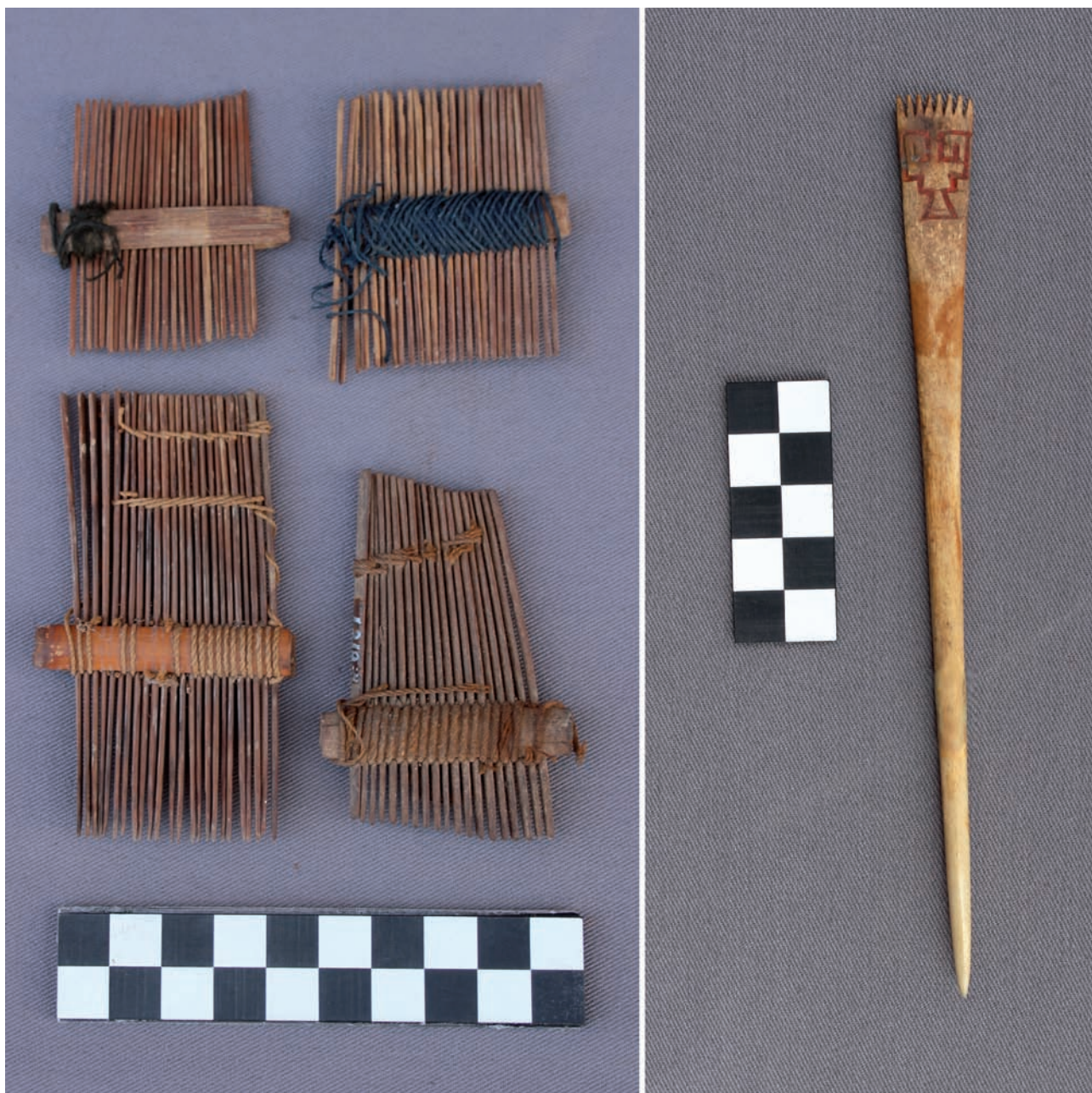
Fig. 9. Weaving tools attached to the external shroud of a funerary bundle from Burial 73

brous material plaited around wooden stiffeners (Bird 1943, 271-272; Dransart 1993; Price et al. 2015, 70).