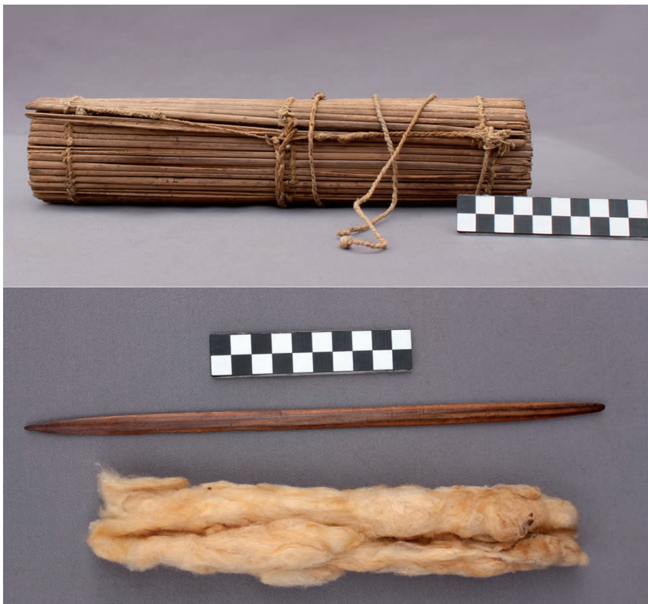
Fig. 3. Spinning toolkit wrapped in a reed mat from Burial 38

gests that yarn ends were twisted by hand during spinning. Microscopic analyses confirm a relatively high level of textile production and the proficiency of local craftsmen. The number of warp yarns usually reached 30-40 per 1 cm 2 of the fabric, while there is usually less than 12 weft yarns per 1 cm 2 of the fabric (Wanot 2021, 395).