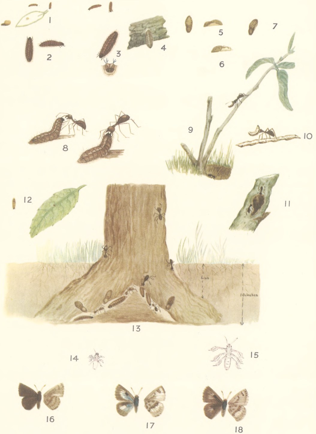
LIFE HISTORY OF LACHNOCNEMA BIBULUS (Fab.).