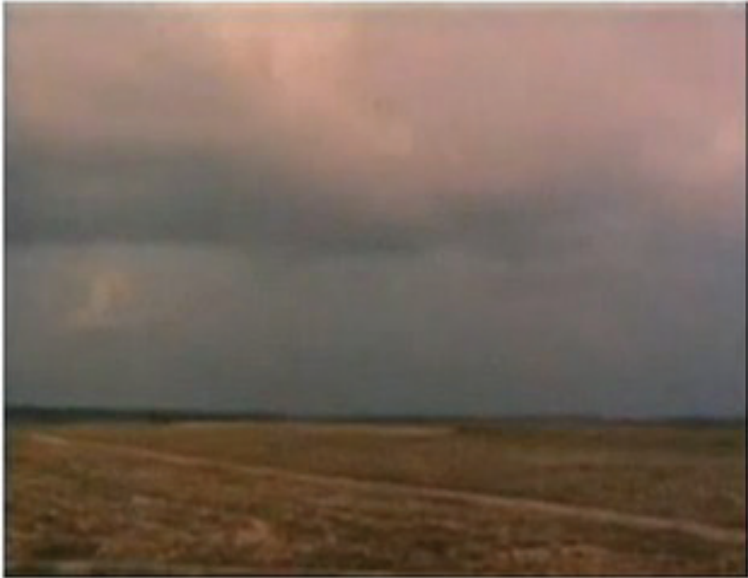
Still from Night and Fog

heterogenic work, which combines an immobile “haunted” landscape with archival material from a newsreel, were to be seen as a source of two parallel idioms of imagining the Holocaust, Lanzmann appears as a faithful follower of the former, “non-representational” line. Shoah ’s influence, and Lanzmann’s position within the discourse of representation of the Holocaust, contributed to the preservation of this way of seeing the space of the Shoah, a paradigm crucial for the experience of landscape by the generation of postmemory.