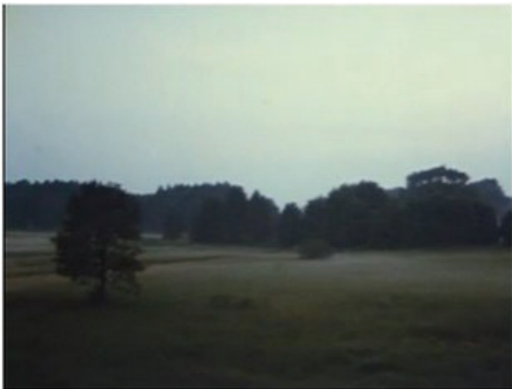
Still from Shoah (Treblinka)

“images without imagination,” images of the Shoah from archival materials preserved in viewers’ memory, he creates at the same time his own aesthetics of “stylised unrepresentability.” 56