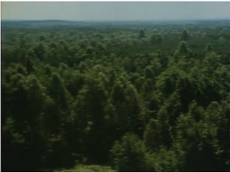
Still from Shoah (forest in Sobibór)