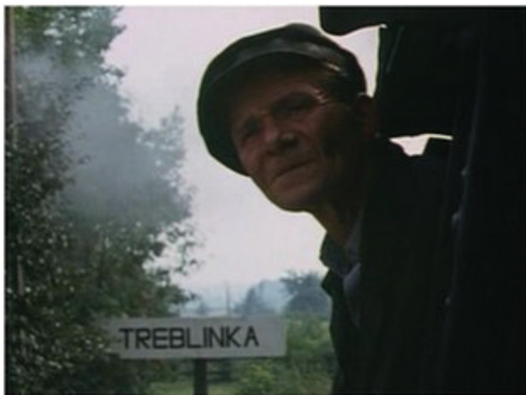
Still from Shoah

has become one of the iconic images of the Holocaust 9 and works as one of the “memory cues” 10 which immediately refer us to a combination of facts and meanings collected under the umbrella term “Holocaust.” 11 Therefore, the iconic nature of this image, which looks like what it refers to, takes on symbolic potential (forming meaning by an arbitrary link between sign and referent) – a sign with the name of a site of slaughter does not only refer to a certain point on the map, but also refers to all other similar locations, and the linguistic nature of this medium only enhances semiotic interpretation.