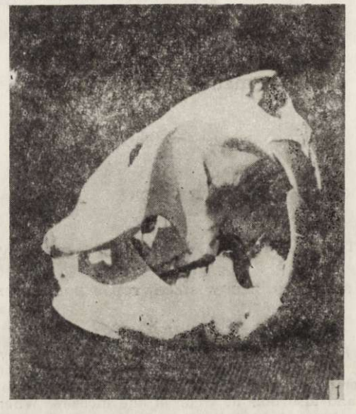
Fig. 1. Correct positioning and wear of the incisors in the European beaver. Male no. 12, caught at Oliwa in 1959, died Jan. 21, 1963 on the farm at Popielno.

This defective bite is often encountered in both free-living and captive beavers (R o m as h o v, 1969). Both lower and upper incisors are capable of excessive growth, and as a rule the loss of one of the incisors causes