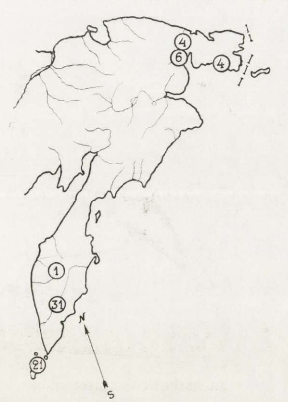
Fig. 1. Trapping location of Sorex cinereus in the North of the Far East USSR. Numbers indicate the number of shrews caught at given place, 4, 6, 4-S. c. port-enkoi, 1, 31-S. c. camtschatica; 21-S. c. leucogaster.

passed through the center of the cones, so that animals running along the fence on either side fell into the cones, which were half filled with water to drown, thus prevent the shrews from eating each other. In determining the relative population number, expressed in per cent, one unit was adopted as the number of shrews caught in one fence during 20 days, i.e. 100 cone-days. The glans penis of adult males and the upper unicuspid teeth of all specimens were measured with an ocular rule under 8 power binoculars. The shade of fur color was determined on the Ridgway scale (1912). The significance of differences between average values was checked as necessary by the Student t test for comparison of averages