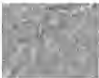
Figure 2: The real fire burnt area based on [17].

according to [17], and Figure 3 - simulated burnt area according to [17].