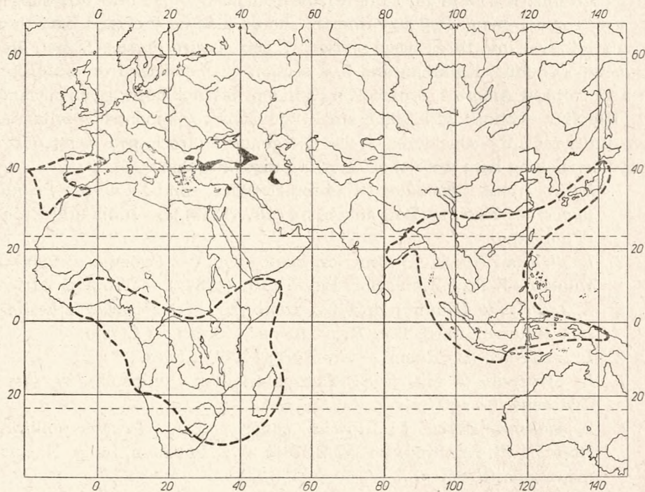
Fig. 1. The range of Laurocerasus officinalis (dark areas) superimposed over the whole range of genus Laurocerasus L. s. str. (= Prunus L. sub sp. Laurocerasus Rehd. sect. Laurocerasus ) according to Kalkman (1965) with the supplement of L. lusitanica from Franco (1964)

From the maps published by Kalkman it appears that the range of the genus Laurocerasus ( s. str. ) is divided into four parts (fig. 1), with the largest concentration of species in southern China (6 species) and in north Vietnam and Burma (4 species each). In Europe only two species are to be found and in western Asia only one — Laurocerasus officinalis .