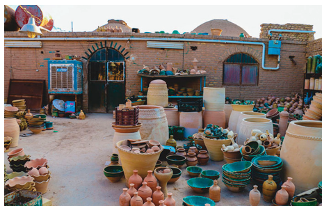
Figure 2. A pottery workshop in Meybod