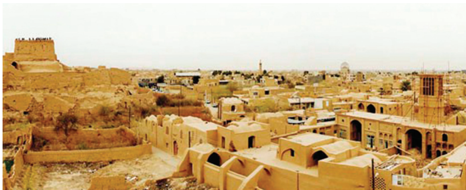
Figure 7. Quality of architecture and designing in Meybod

Regarding the changes in the capability of local creative industries, it was remarked that the quality of architecture and designing has improved substantially over the past ten years. In this respect, Meybod businesses are now utilizing local creative services rather than turning straight to Yazd facilities, as they did in the past (Fig. 7).