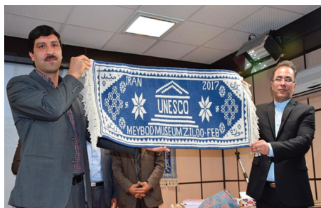
Figure 3. Zilu industry in Meybod

of Ardekan as a place, resources available to creative businesses, and the effect of proximity to Yazd. The length of each interview was approximately one hour.