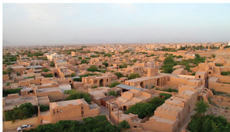
Figure 8. Heritage buildings

the uniqueness of 'a city in the desert'. A mixture of historical and contemporary modes of architecture has created an interesting place endowed with both aesthetic features and a traditional flavor (Fig. 8). Among the interviewees, however, one was of the opinion that Meybod lacks leisure amenities for young adults, especially night-life resorts.