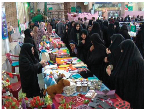
Figure 6. Festival of handicrafts in Meybod

texture firms had opened offices in Meybod. The number of firms has increased because large architectural firms have split into multiple smaller firms. Increasing the number of private art galleries (such as lilit Gallery), investment in public arts infrastructure (such as Yazd Art Gallery), and instigation of music festivals (including traditional music festivals) and crafts and traditional foods festival were noted as signs of growth in the creative economy (Fig. 6).