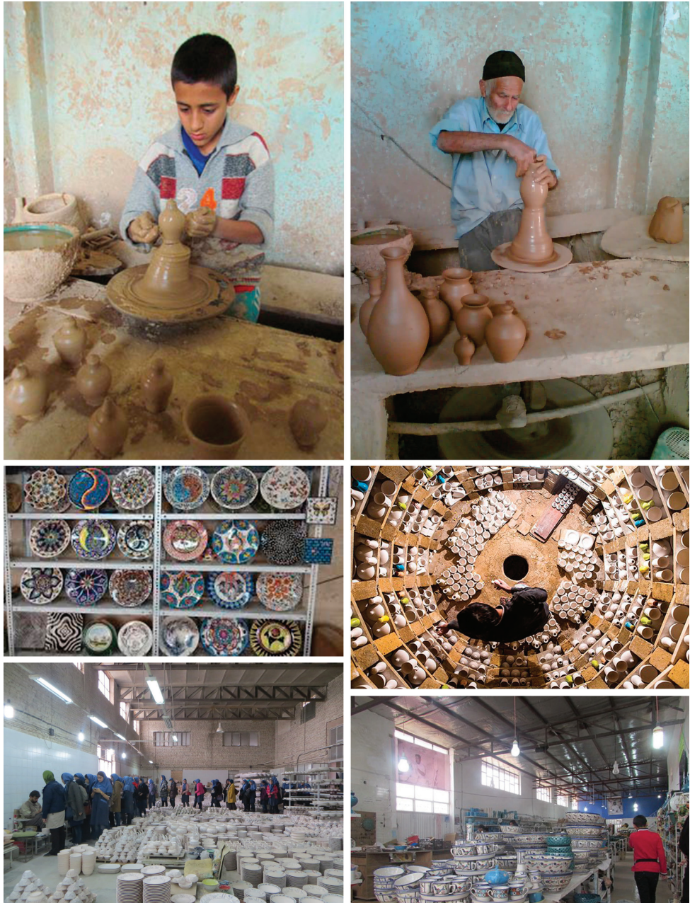
Figure 5. Art of pottery in Meybod

Several informants remarked that some artists live outside Meybod (i.e. in rural areas) but come to the city to work or engage with clients. Regarding the changes in crea-