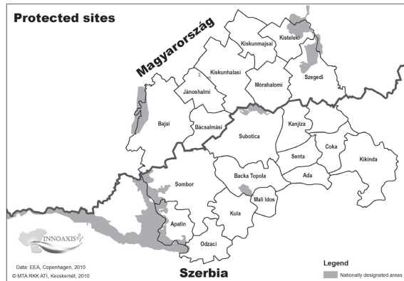
Figure 3. Protected sites

The image of the region is defined by pusztas, meadows, wetland habitats, forests and agricultural areas. Despite of the lowland features, the area is diverse and rich in natural resources whose ecosystems include the sand pusztas, loess ridges and alluvial plains. The determining elements of the natural environment of the region are the Danube, the Tisza and their tributaries and backwaters, and the protected areas which also include nature conservation areas of international importance (Figure 3). These, on the one hand, provide opportunity for creating green corridor systems; and on the other hand, also represent a recreational potential. In this respect, the harmonisation of the development of the linear infrastructural networks and of the natural environment – within it in particular the patterns of the traffic routes and the green corridors, and the protected natural values in the landscape – means a great challenge especially along the River Danube.