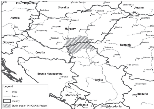
Figure 1. The examined area of the Serbian-Hungarian cross-border region

The regions lying along the Serbian-Hungarian border are coherent from the aspect of the landscape and the environment, in fact there is no natural borderline running between the two countries (Figure 1). The region occupies a peculiar geographical position between the River Danube and River Tisza which has been divided by the present border for almost a century now.